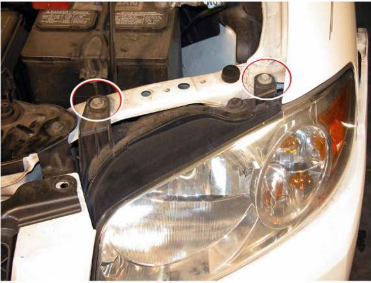
5. Remove two 10mm headlight bolts