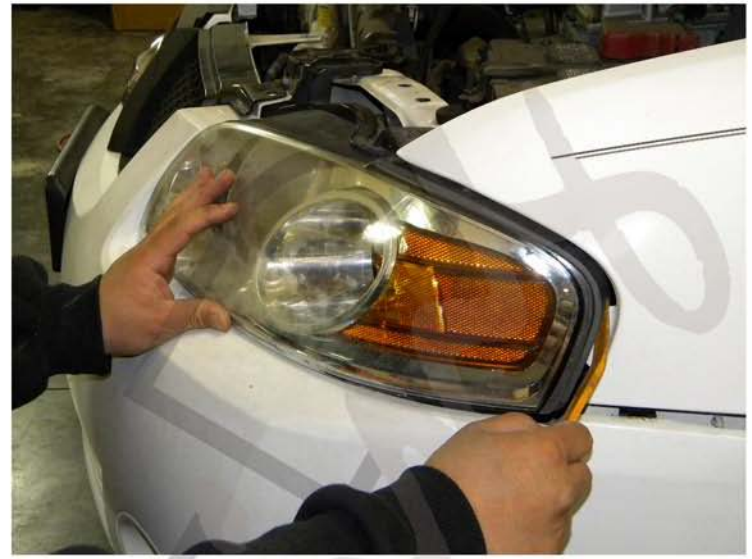
6. Remove headlight