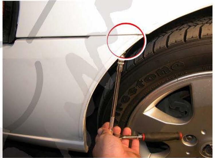
2. Remove first 10mm bolt at side of bumper