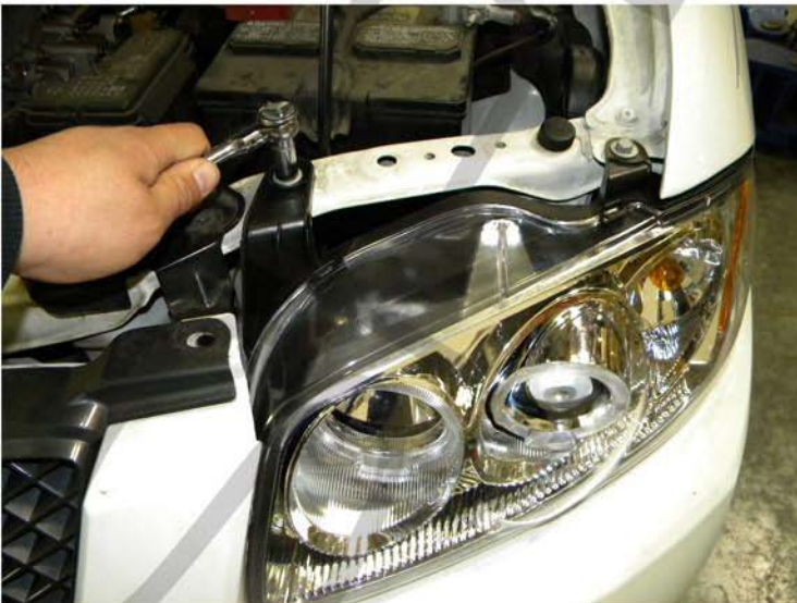
9. Install two 10mm headlight bolts