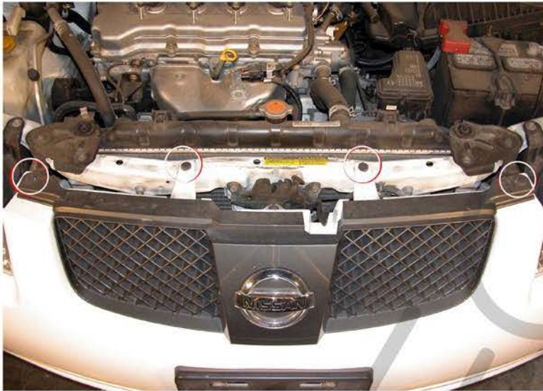
1. Remove four clips

If you experience any difficulties that the instruction did not cover, Please seek local auto shop for advise. Please wear protection before you work on your vehicle. An assistant is helpful when removing the front bumper. Please be careful while working with the bumper or body part to avoid scratching. Do not make direct contact with the halogen bulb or the wire assembly until the unit has cooled down after use.