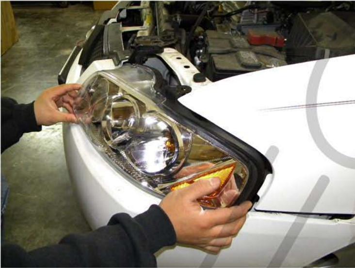
7. Install new projector headlight