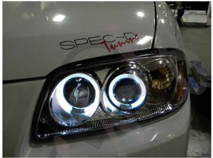
12. The installation is now complete