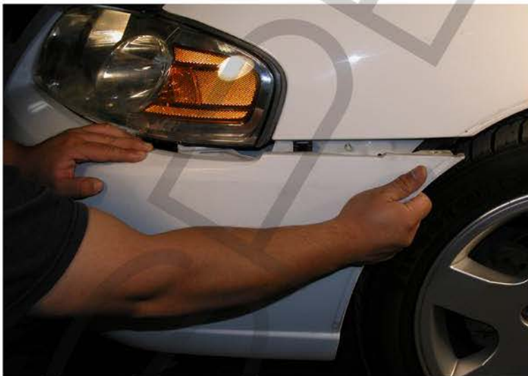
3. Pull out the bumper