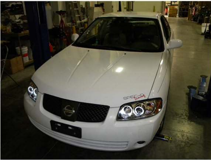
11. Please repeat the steps from 1 to 10 for opposite side