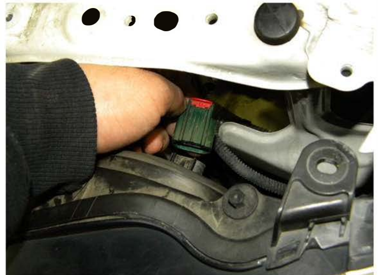
4. Disconnect headlight harness