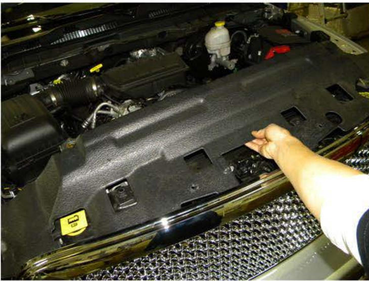
23. Replace the plastic guard