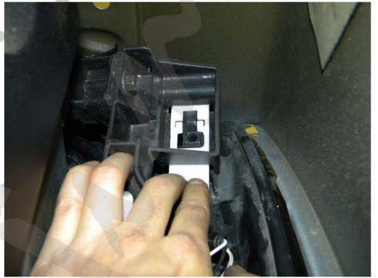
26. Lock the plastic headlight retainer