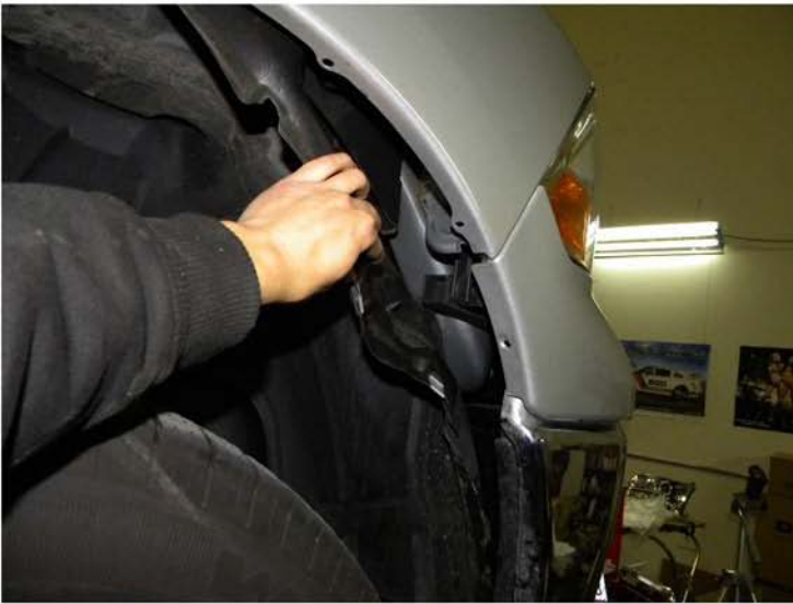
11. Pull the liner to the side