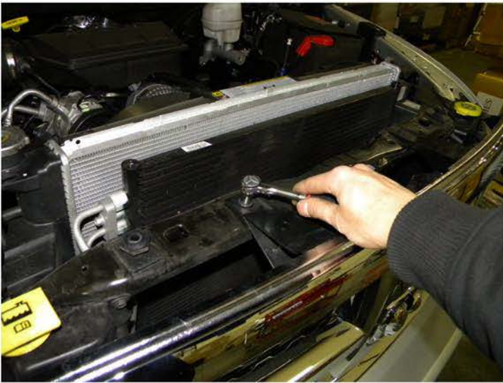
5. Remove the (4) 10mm bolts