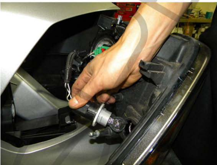
15. Unplug the light socket