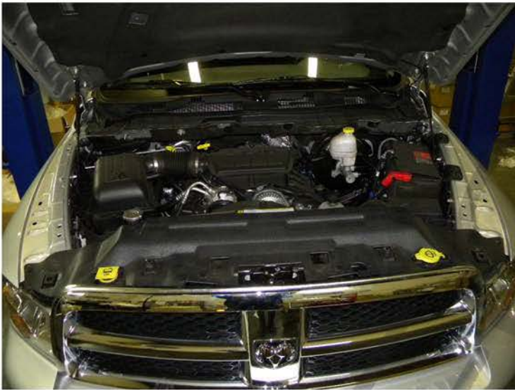
1. (6) plastic clips location

Do not make direct contact with the halogen bulbs or the wire assembly until the unit has cooled down after use.