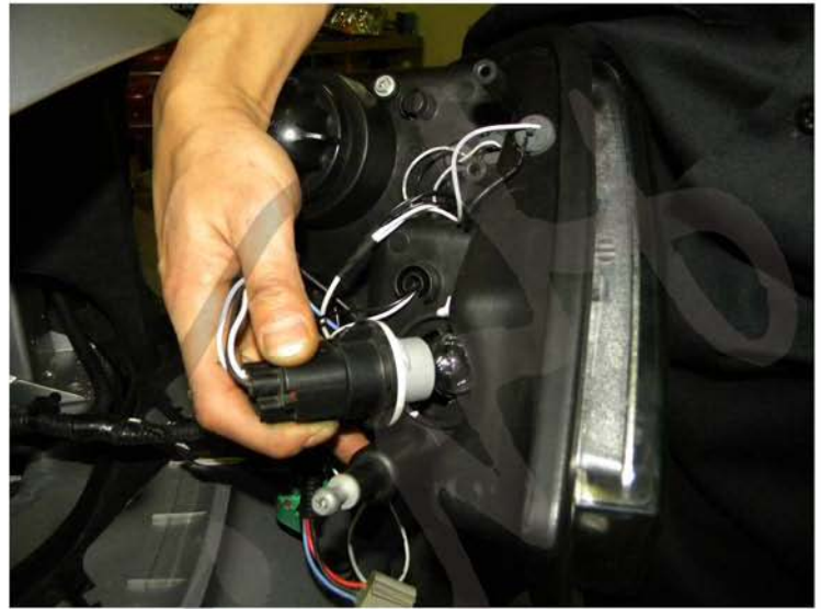
18. Plug the light socket into the new headlight