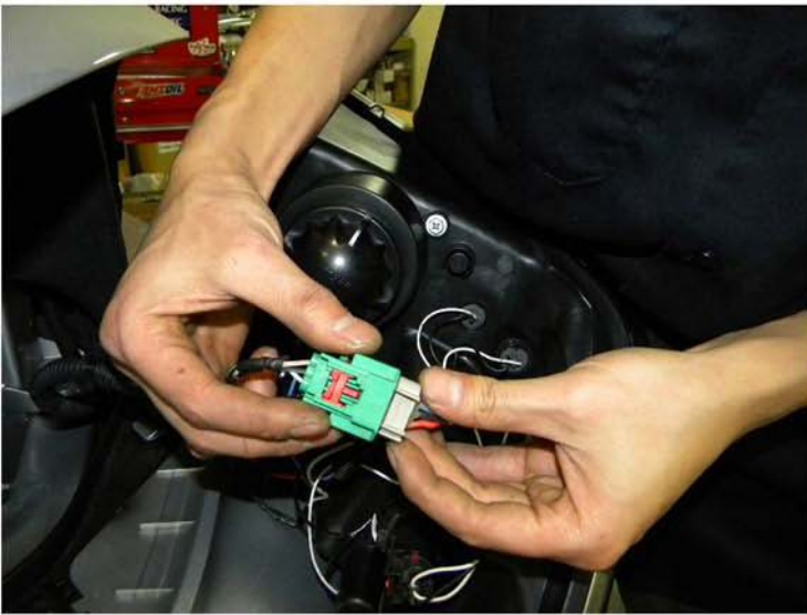
17. Connect the headlight harness into the new headlight Please see the Halo and L.E.D installation instruction If your headlights don't have HALO or L.E.D. You can skip it