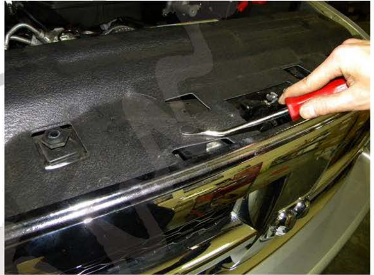
2. Remove the (6) plastic clips