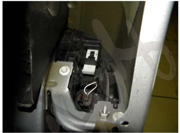
12. Plastic headlight retainer