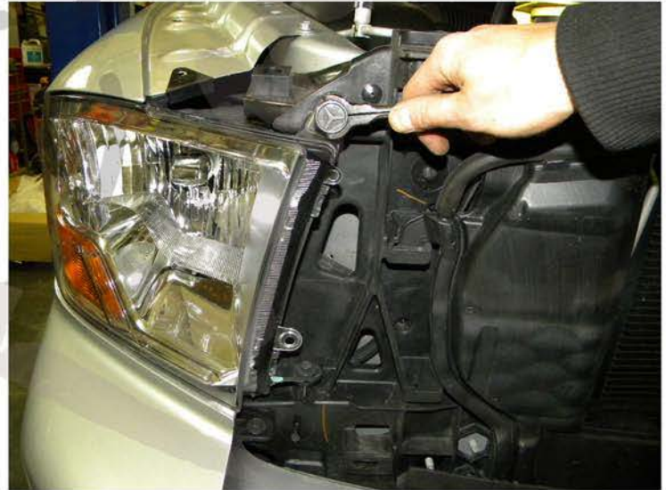
8. Remove the (2) 10mm bolts