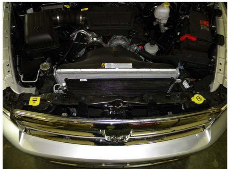
4. (4) 10mm bolts location