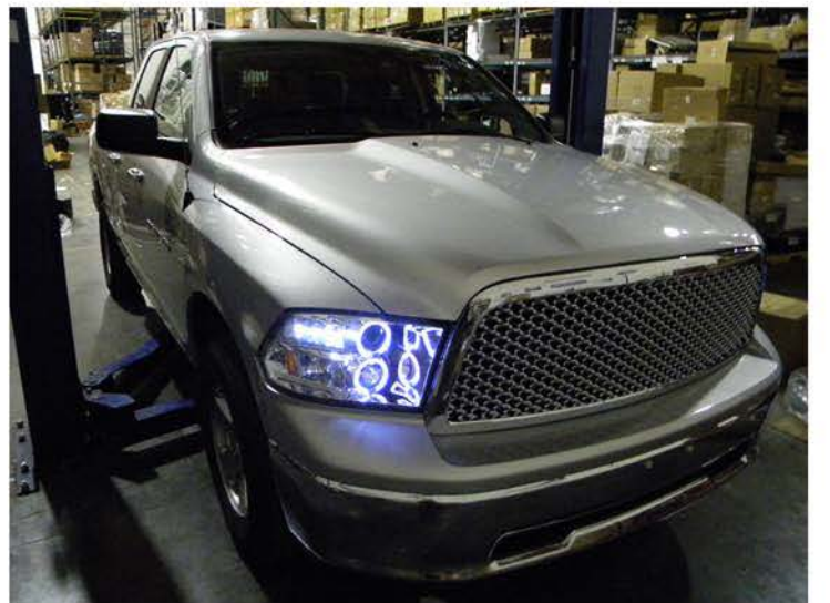
28. The installation is now complete