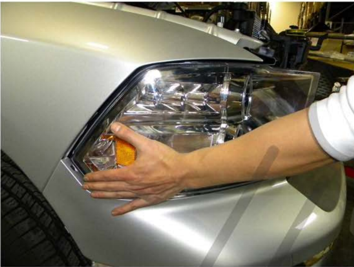
19. Place new headlight in the stock location