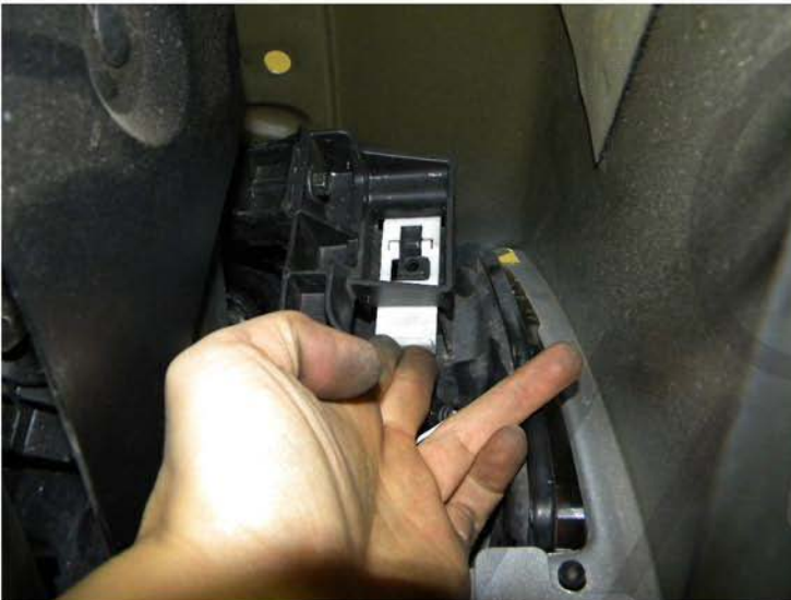
13. Push the retainer up to unlock the headlight