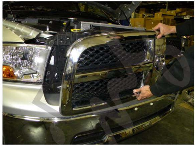
6. Remove the front grill