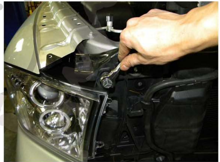
20. Tighten the (2) 10mm bolts