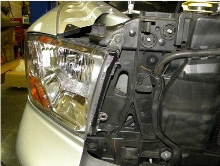
7. (2) 10mm bolts location