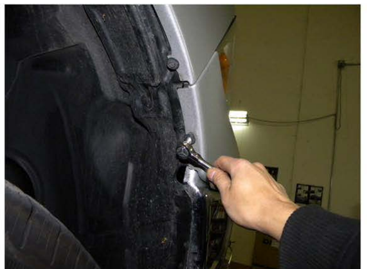
10. Remove the (2) 10mm bolts