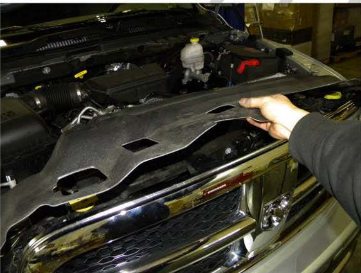
3. Remove the plastic guard