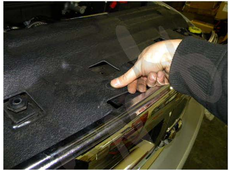
24. Replace the (6) plastic clips