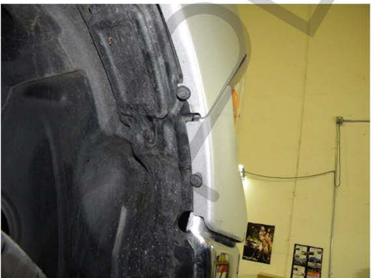
9. (2) 8mm bolts location