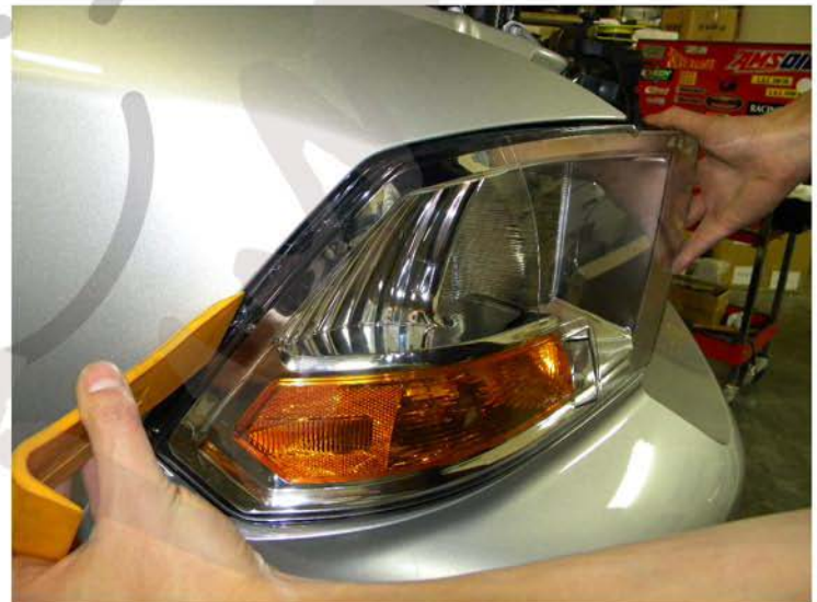
14. Remove the headlight