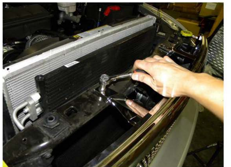
22. Tighten the (4) 10mm screws