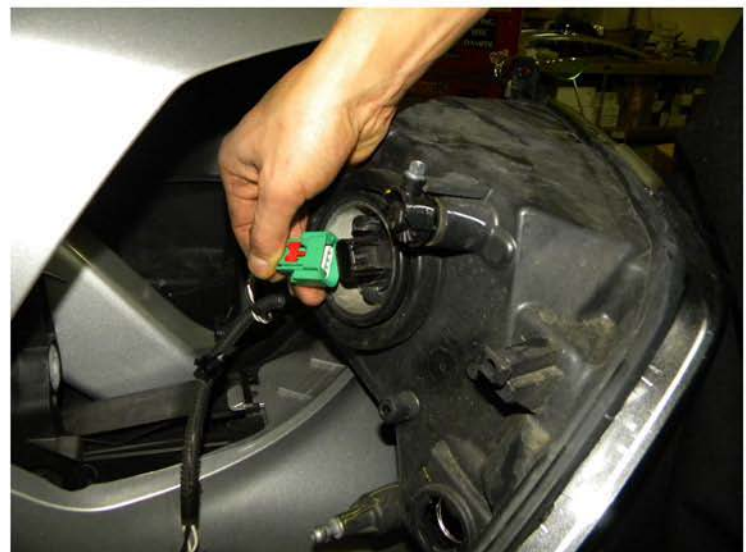
16. Unplug the headlight harness