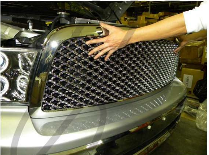
21. Replace the front grill