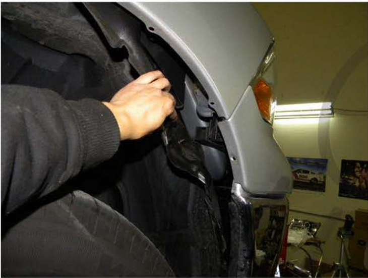
25. Pull the liner to the side