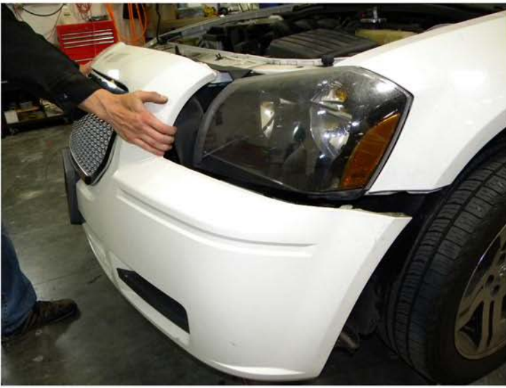
11. Install the front bumper