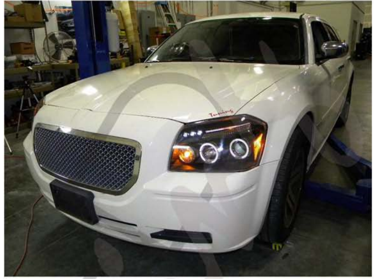
12. Please repeat the picture order from 1 to 11 for the opposite side