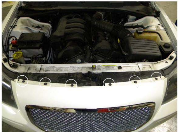
4. Remove six clips