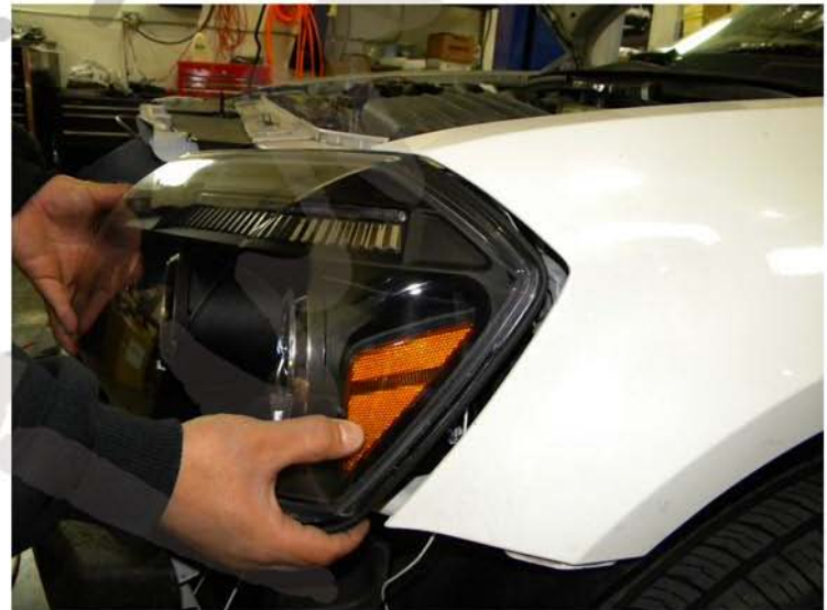
8. Install the new projector headlight