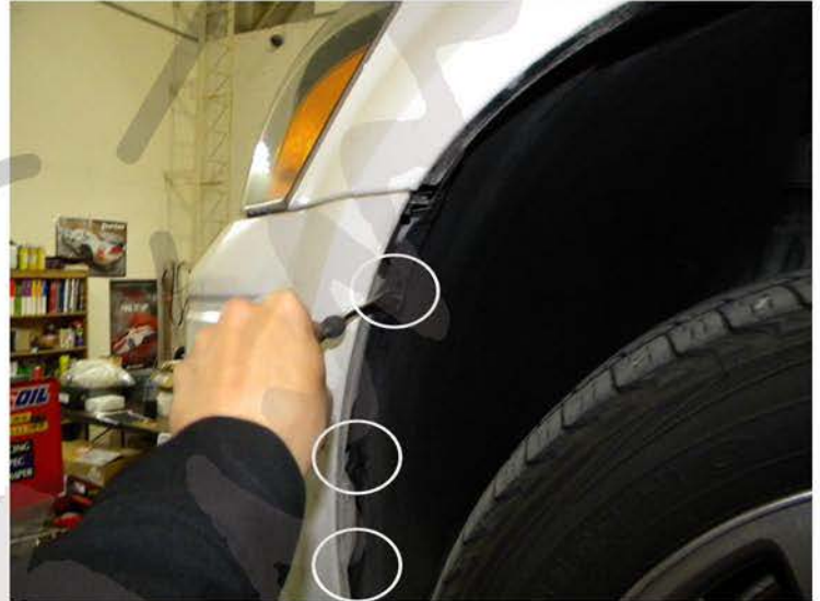
2. Remove three clips