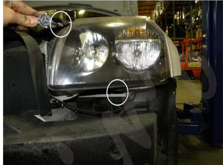
6. Remove two 8mm headlight bolts