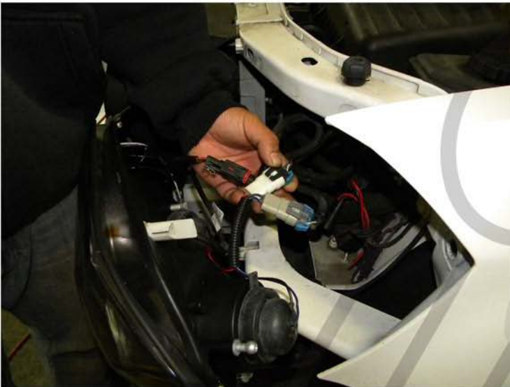
7. Disconnect all the connectors from the headlight