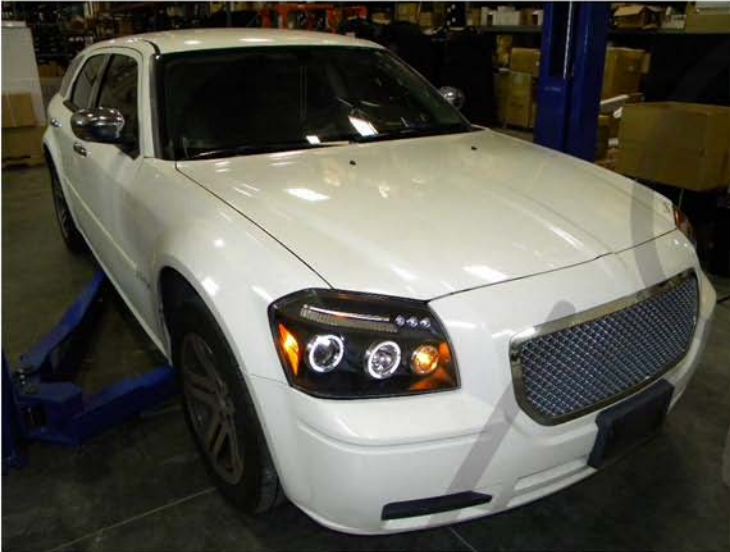
13. The installation is now complete