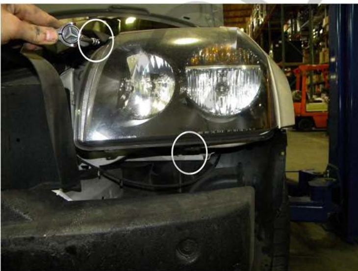
9. Install two 8mm headlight bolts