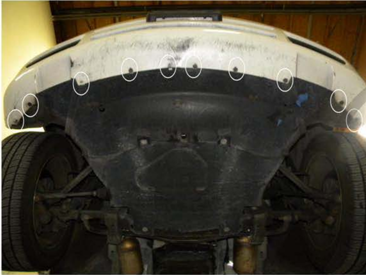
1. Remove ten 7mm bolts

If you experience any difficulties that the instruction did not cover, Please seek local auto shop for advise. Please wear protection before you work on your vehicle. An assistant is helpful when removing the front bumper. Please be careful while working with the bumper or body part to avoid scratching. Do not make direct contact with the halogen bulb or the wire assembly until the unit has cooled down after use.