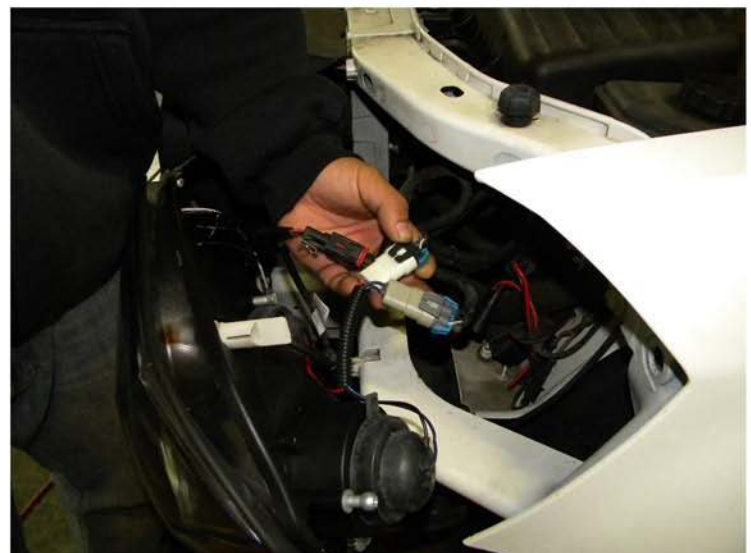
10. Connect all connectors from the headlight Please see the Halo and L.E.D installation instruction If your headlights don't have HALO or L.E.D. You can skip it