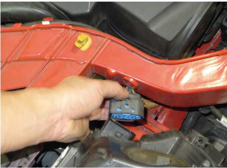
5. Disconnect the headlight harness and remove the headlight