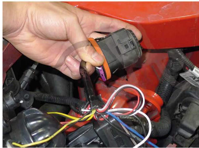
6. Connect the headlight harness to the projector headlight