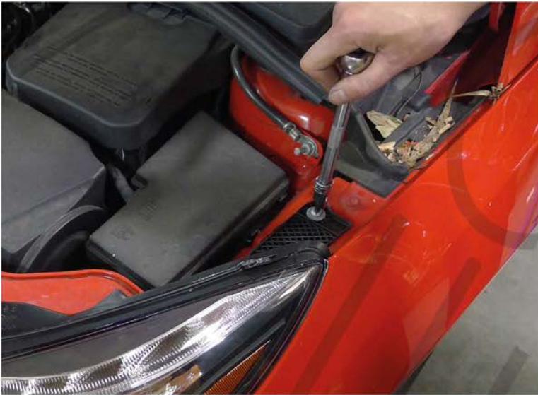
7. Tighten the (2) T30 bolts