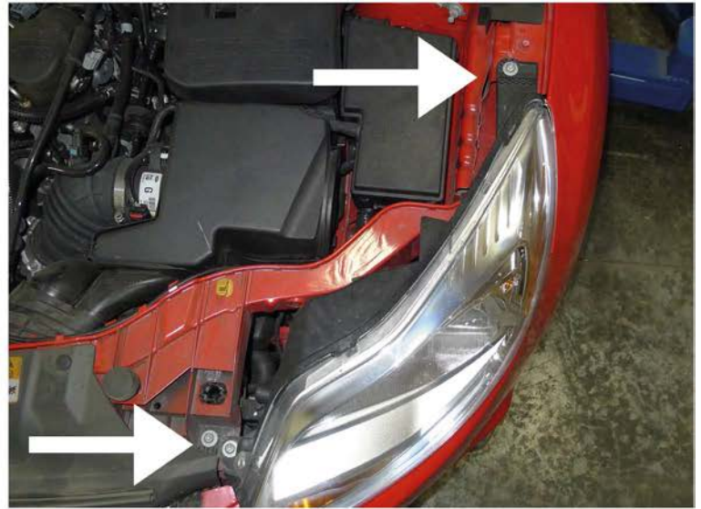
2. (2) T30 bolts location