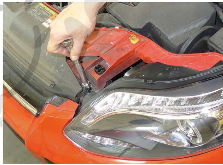
8. Tighten the (2) T30 bolts Please repeat the steps from 1 to 8 for the opposite side