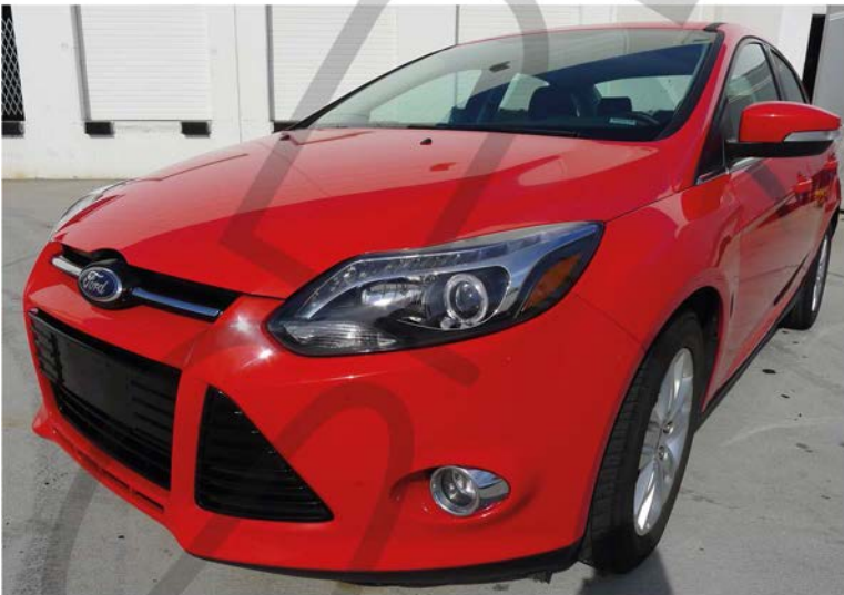
9. The installation now is complete