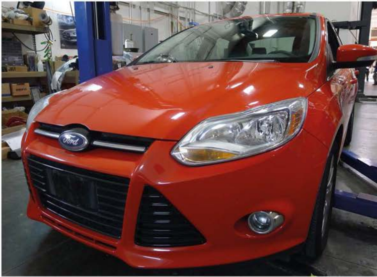
1. (2) 10mm bolts and 9 8mm bolts location

Do not make direct contact with the halogen bulbs or the wire assembly until the unit has cooled down after use.