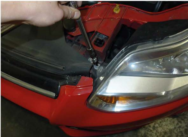
3. Remove the (2) T30 bolts