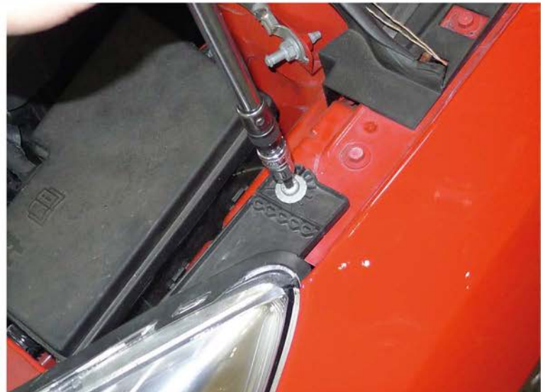
4. Remove the (2) T30 bolts