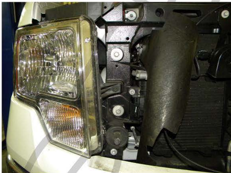
3. 10mm bolt location