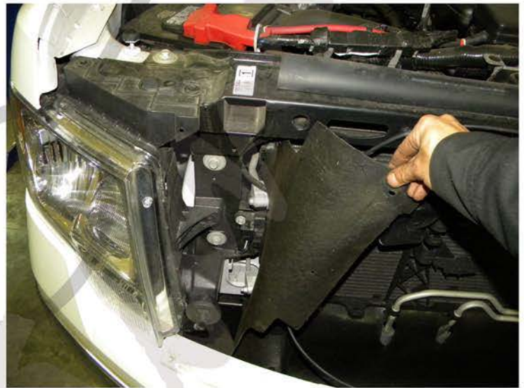
2. Pull the rubber shield to the side