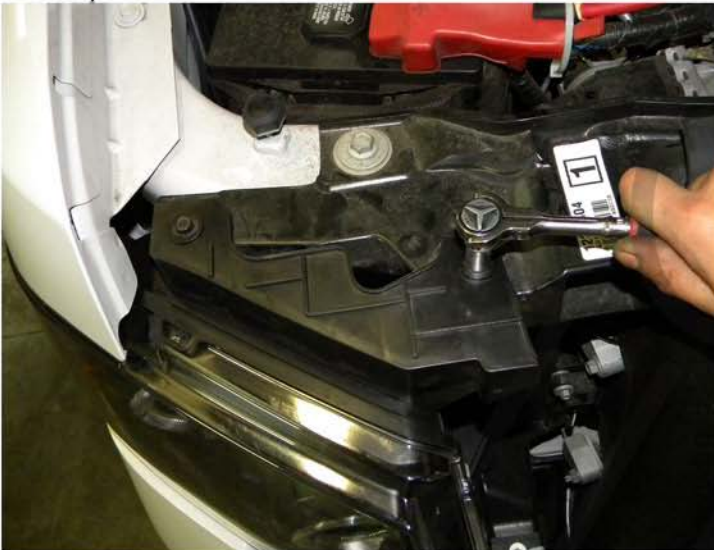
13. Tighten the (2) 10mm bolts