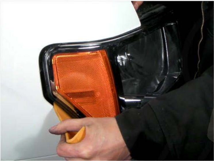
7. Remove the headlight