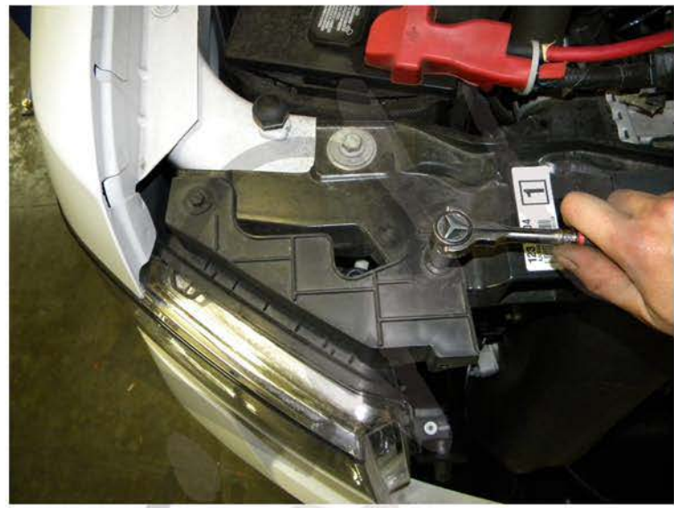
6. Remove the (2) 10mm bolts