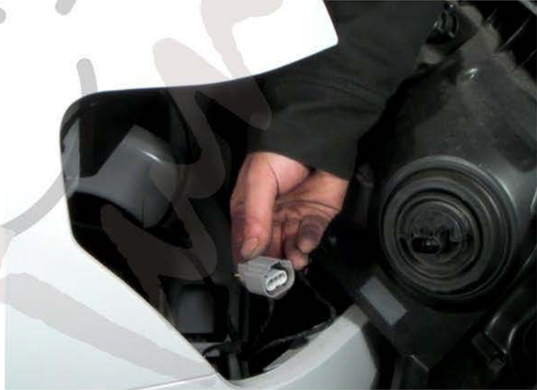
8. Disconnect the headlight harness