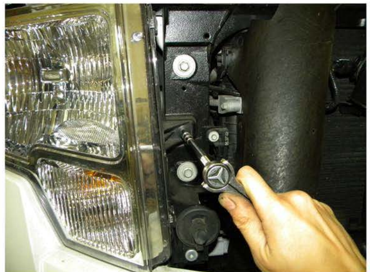
4. Remove the 10mm bolt