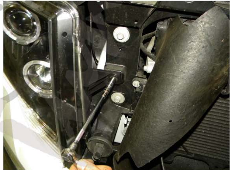
14. Tighten the 10mm bolt