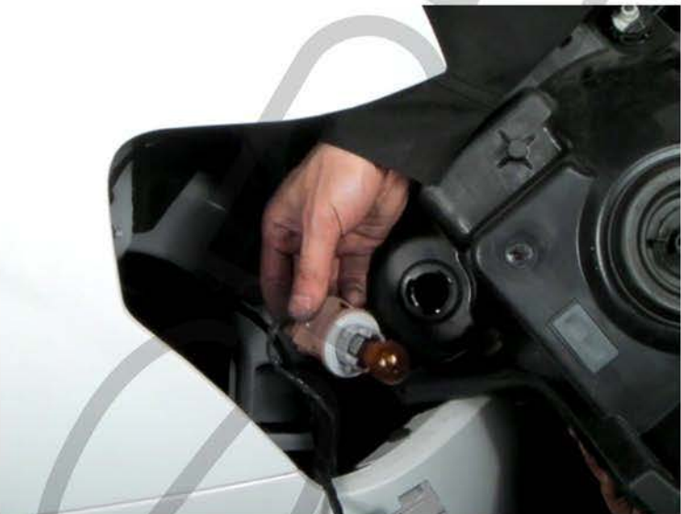
9. Disconnect the headlight harness