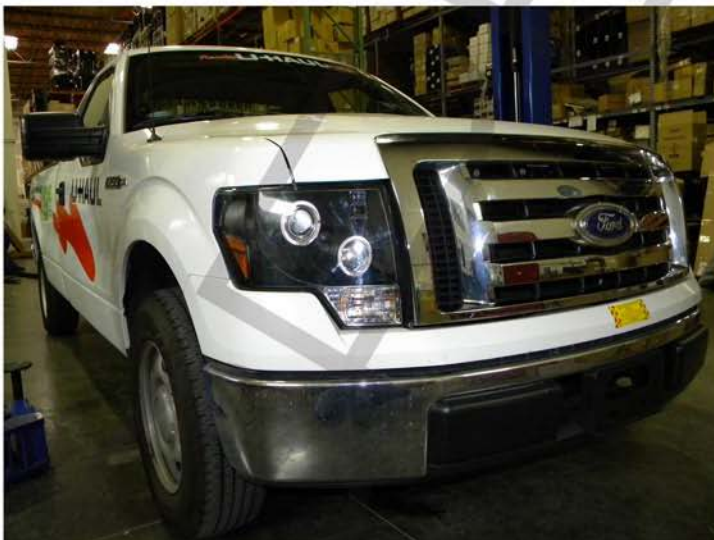
15. Remove the headlight Please repeat the steps in order from 1 to 14 for the opposite side