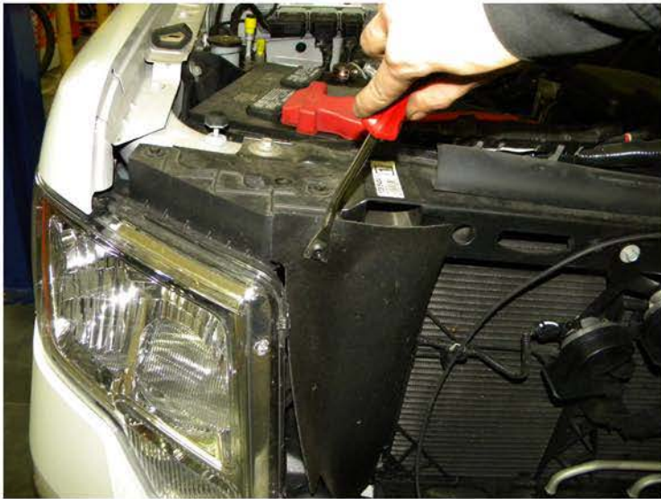
1. Remove the plastic lip

Do not make direct contact with the halogen bulbs or the wire assembly until the unit has cooled down after use.