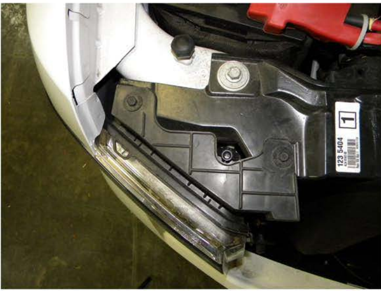
5. (2) 10mm bolts location