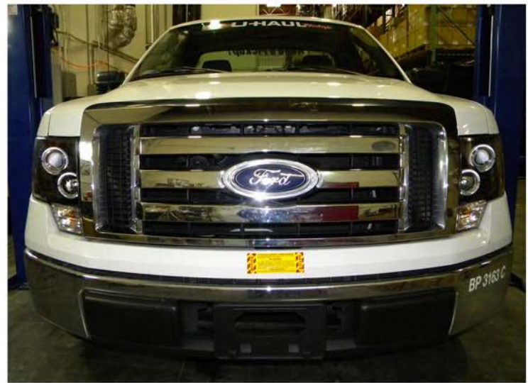
16. The installation is now complete