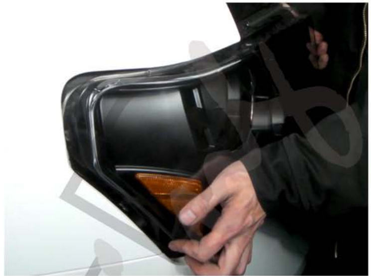
12. Place the new headlight in the stock location