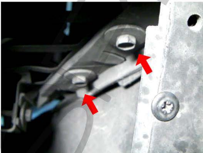
15. Install two bolts under wheel well