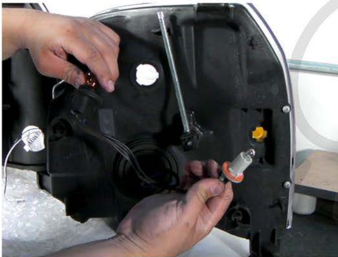
7. Remove the harness from the OEM headlight