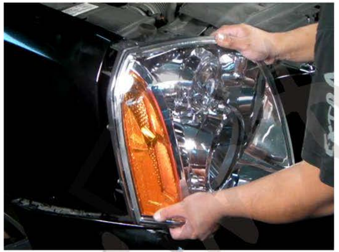
12. Put the new headlight into the original spot