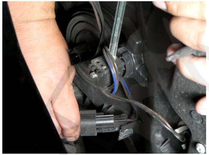
6. Disconnect the connectors from the headlight