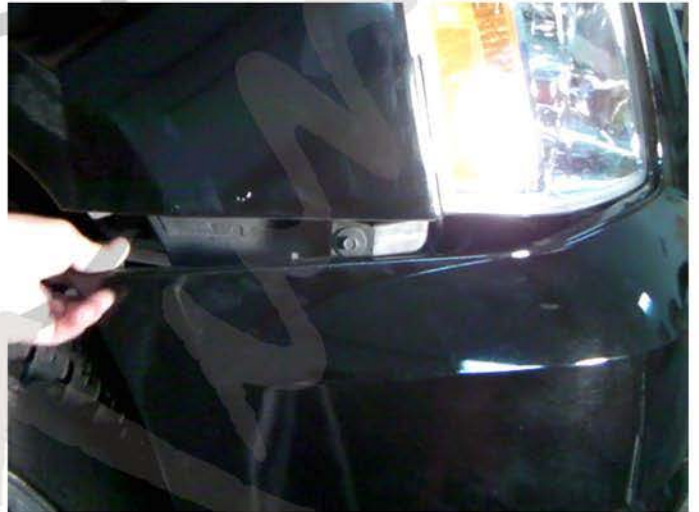
14. Install one hidden bolt between the bumper and fender