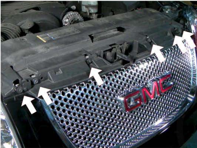
1. Open the hood, there are six bolts that needs to be removed

If you experience any difficulties that the instruction did not cover, Please seek local auto shop for advise. Please wear protection before you work on your vehicle. An assistant is helpful when removing the front bumper. Please be careful while working with the bumper or body part to avoid scratching. Do not make direct contact with the halogen bulb or the wire assembly until the unit has cooled down after use.