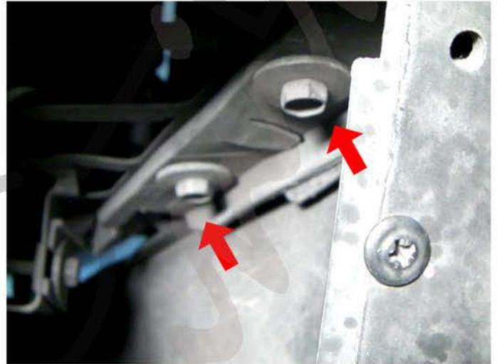
2. Remove two bolts under wheel well