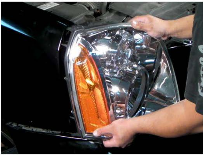
5. Pull out the headlight a little bit, just enough to see the wire harness in the back