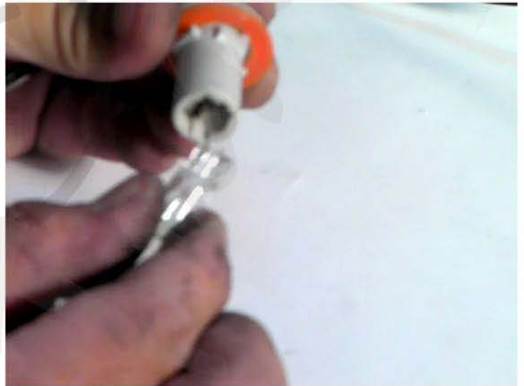
8. Pull out the driving light bulb