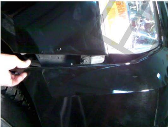
3. Remove one hidden bolt between the bumper and fender