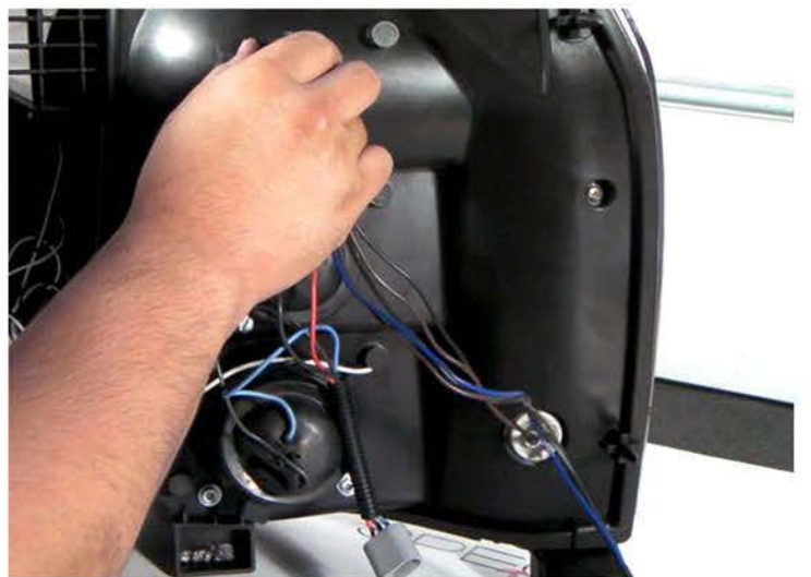
10. Connect all the connectors and harness to new headlight Please see the "Halo and L.E.D installation instructions" If your headlights don't have HALO or L.E.D. You can skip