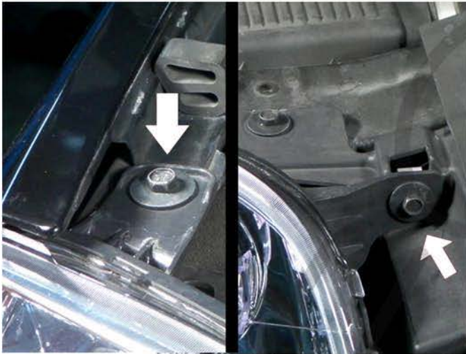
13. Install two bolts to fasten the headlight