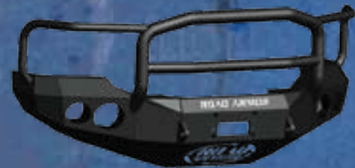
STEALTH BASE FRONT BUMPER WITH LONESTAR GUARD