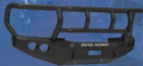
STEALTH BASE FRONT BUMPER WITH TITAN II GUARD