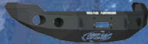
STEALTH BASE FRONT BUMPER