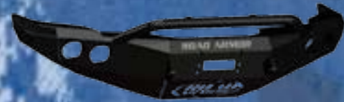
STEALTH BASE FRONT BUMPER WITH PRE-RUNNER GUARD