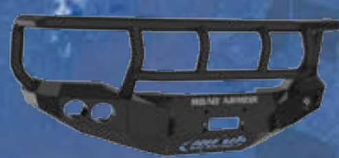
STEALTH BASE FRONT BUMPER WITH TITAN II GUARD