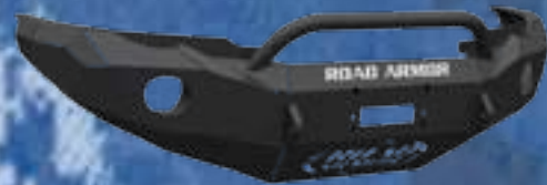
STEALTH BASE FRONT BUMPER WITH PRE-RUNNER GUARD