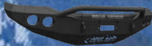
STEALTH BASE FRONT BUMPER WITH PRE-RUNNER GUARD