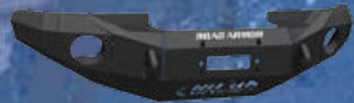
STEALTH BASE FRONT BUMPER