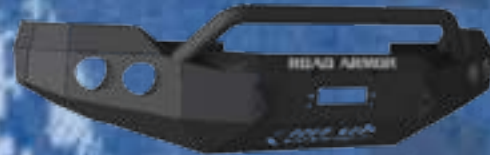
STEALTH BASE FRONT BUMPER WITH PRE-RUNNER GUARD