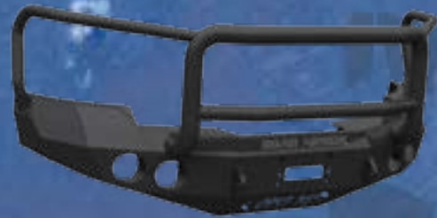
STEALTH BASE FRONT BUMPER WITH LONESTAR GUARD