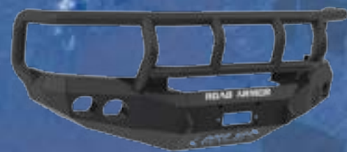
STEALTH BASE FRONT BUMPER WITH TITAN II GUARD