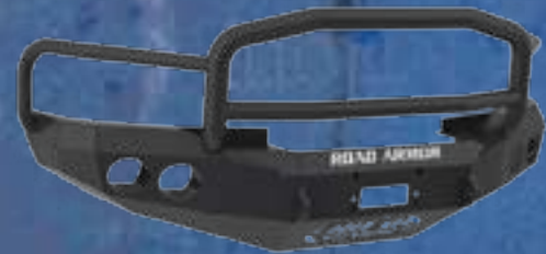
STEALTH BASE FRONT BUMPER WITH LONESTAR GUARD