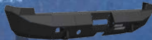
STEALTH BASE REAR BUMPER