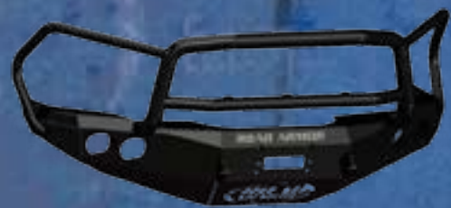
STEALTH BASE FRONT BUMPER WITH LONESTAR GUARD