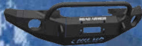
STEALTH BASE FRONT BUMPER WITH BULL BAR