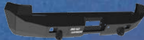
STEALTH BASE REAR BUMPER