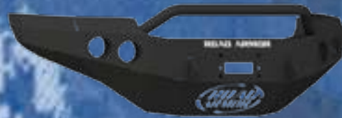
STEALTH BASE FRONT BUMPER WITH PRE-RUNNER GUARD