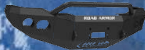
STEALTH BASE FRONT BUMPER WITH PRE-RUNNER GUARD