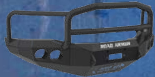
STEALTH BASE FRONT BUMPER WITH LONESTAR GUARD