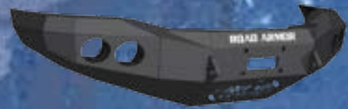
STEALTH BASE FRONT BUMPER