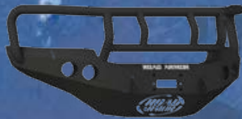
STEALTH BASE FRONT BUMPER WITH TITAN II GUARD