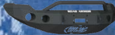
STEALTH BASE FRONT BUMPER WITH PRE-RUNNER GUARD