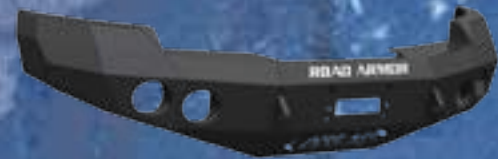
STEALTH BASE FRONT BUMPER