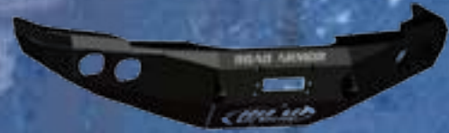
STEALTH BASE FRONT BUMPER