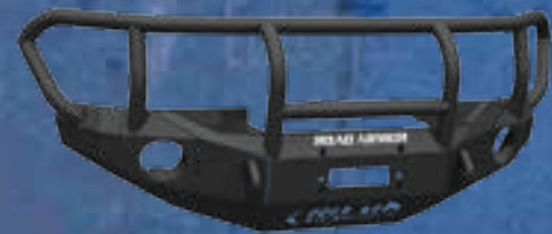
STEALTH BASE FRONT BUMPER WITH TITAN GUARD