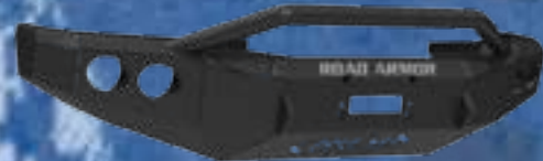
STEALTH BASE FRONT BUMPER WITH PRE-RUNNER GUARD