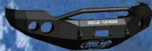
STEALTH BASE FRONT BUMPER WITH PRE-RUNNER GUARD