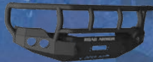
STEALTH BASE FRONT BUMPER WITH TITAN II GUARD