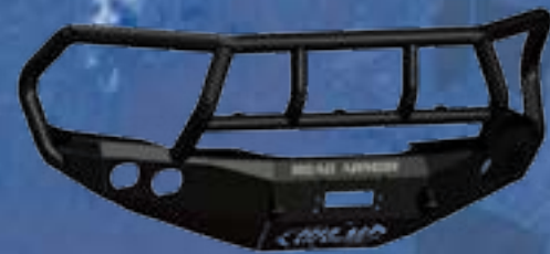
STEALTH BASE FRONT BUMPER WITH TITAN II GUARD