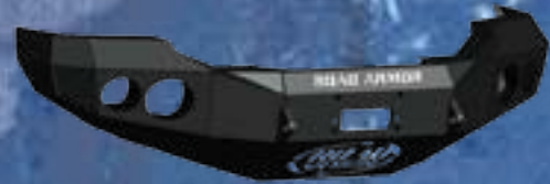
STEALTH BASE FRONT BUMPER