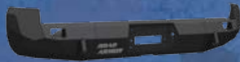
STEALTH BASE REAR BUMPER