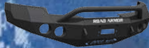
STEALTH BASE FRONT BUMPER WITH PRE-RUNNER GUARD