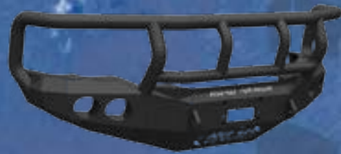
STEALTH BASE FRONT BUMPER WITH TITAN II GUARD