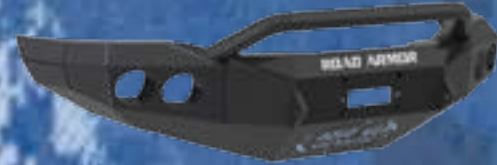
STEALTH BASE FRONT BUMPER WITH PRE-RUNNER GUARD