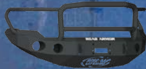
STEALTH BASE FRONT BUMPER WITH LONESTAR GUARD