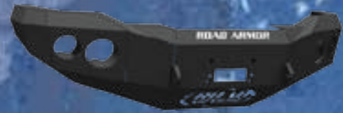
STEALTH BASE FRONT BUMPER