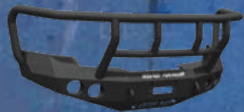
STEALTH BASE FRONT BUMPER WITH TITAN II GUARD