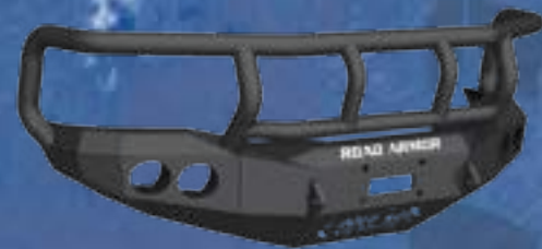
STEALTH BASE FRONT BUMPER WITH TITAN II GUARD