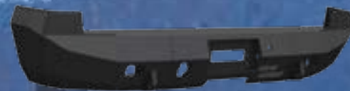
STEALTH BASE REAR BUMPER