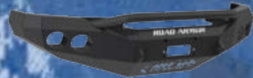
STEALTH BASE FRONT BUMPER WITH PRE-RUNNER GUARD