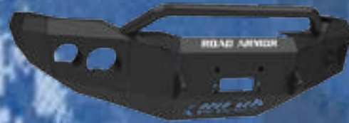
STEALTH BASE FRONT BUMPER WITH PRE-RUNNER GUARD