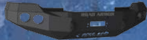
STEALTH BASE FRONT BUMPER