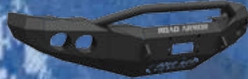
STEALTH BASE FRONT BUMPER WITH PRE-RUNNER GUARD