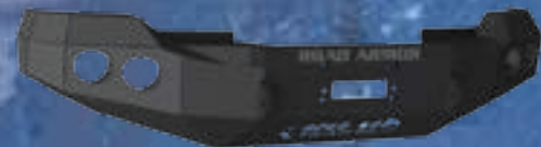
STEALTH BASE FRONT BUMPER