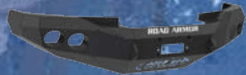
STEALTH BASE FRONT BUMPER