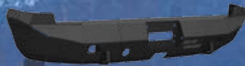
STEALTH BASE REAR BUMPER