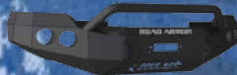
STEALTH BASE FRONT BUMPER WITH PRE-RUNNER GUARD