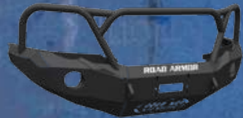
STEALTH BASE FRONT BUMPER WITH AGGRO GUARD