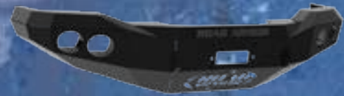
STEALTH BASE FRONT BUMPER