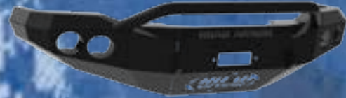
STEALTH BASE FRONT BUMPER WITH PRE-RUNNER GUARD