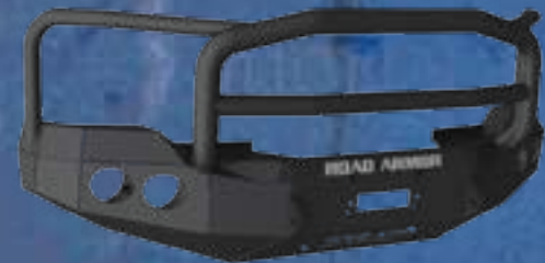
STEALTH BASE FRONT BUMPER WITH LONESTAR GUARD