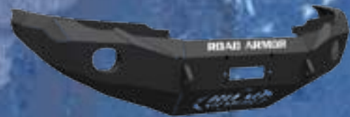
STEALTH BASE FRONT BUMPER