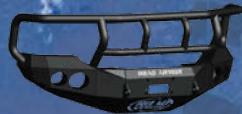
STEALTH BASE FRONT BUMPER WITH TITAN II GUARD