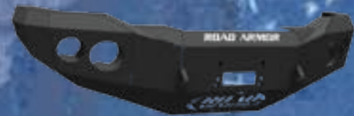
STEALTH BASE FRONT BUMPER