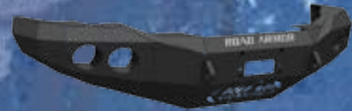
STEALTH BASE FRONT BUMPER