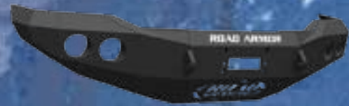
STEALTH BASE FRONT BUMPER