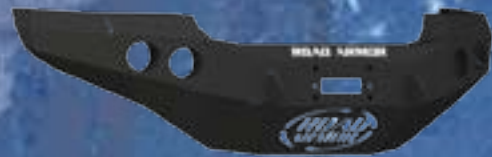
STEALTH BASE FRONT BUMPER