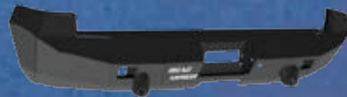
STEALTH BASE REAR BUMPER