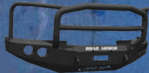
STEALTH BASE FRONT BUMPER WITH LONESTAR GUARD