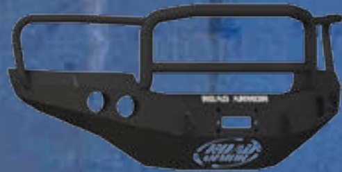
STEALTH BASE FRONT BUMPER WITH LONESTAR GUARD