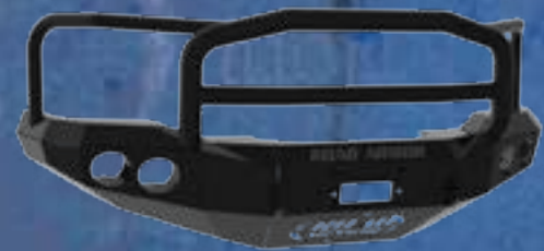
STEALTH BASE FRONT BUMPER WITH LONESTAR GUARD