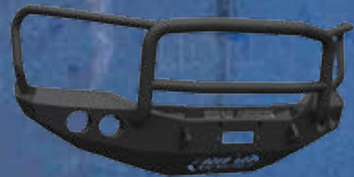
STEALTH BASE FRONT BUMPER WITH LONESTAR GUARD