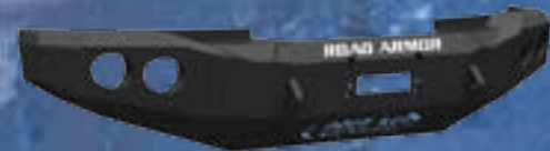
STEALTH BASE FRONT BUMPER