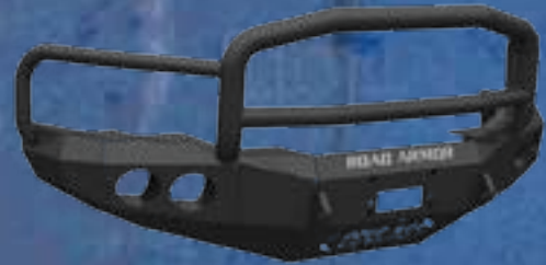
STEALTH BASE FRONT BUMPER WITH LONESTAR GUARD