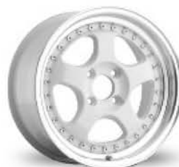
WHITE / MACHINED LIP