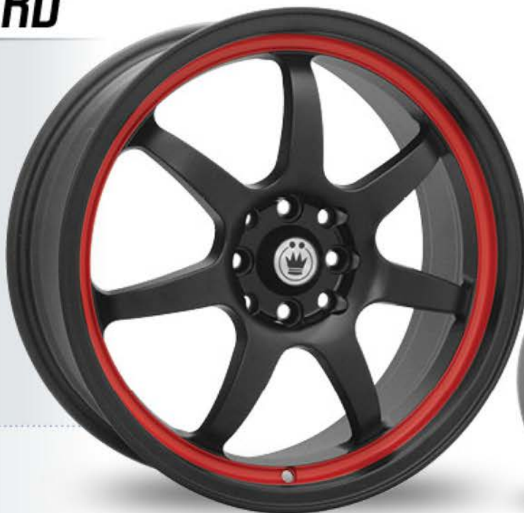
MATTE BLACK / RED STRIPE