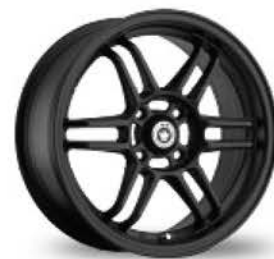
FULL MATTE BLACK