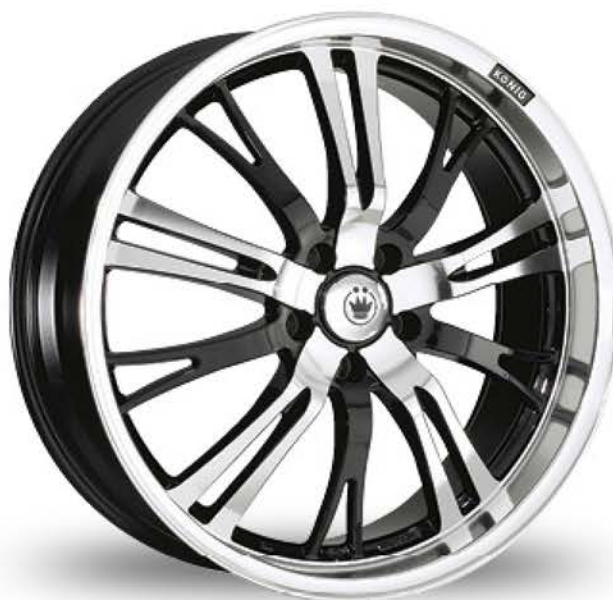
BLACK / MACHINED FACE