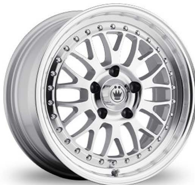
SILVER / MACHINED FACE