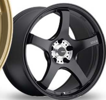
MATTE BLACK / MACHINED PCD