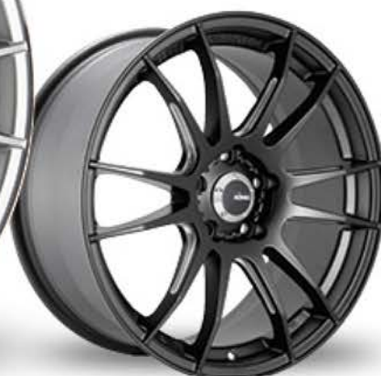
MATTE BLACK & BALL MILLED ACCENTS