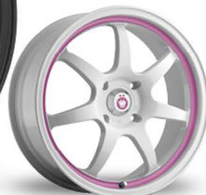
WHITE / PINK STRIPE