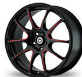
BLACK / RED BALL CUT