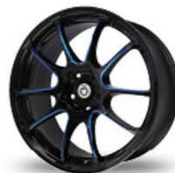
BLACK / BLUE BALL CUT