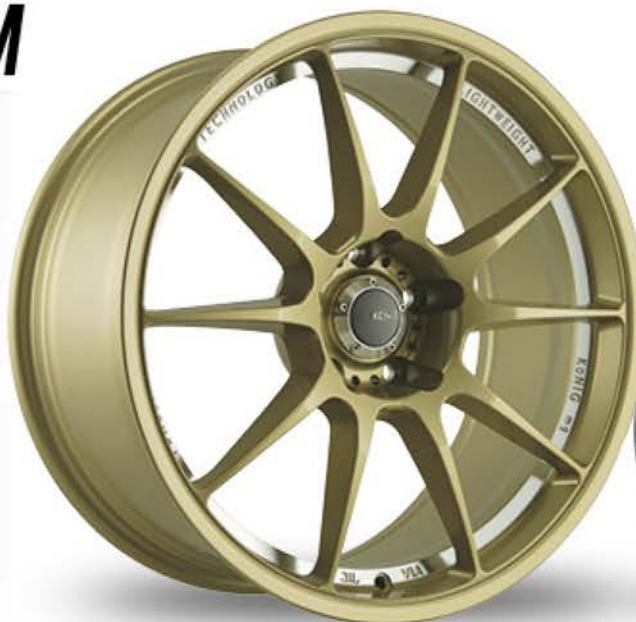
GOLD / MACHINED UNDERCUT