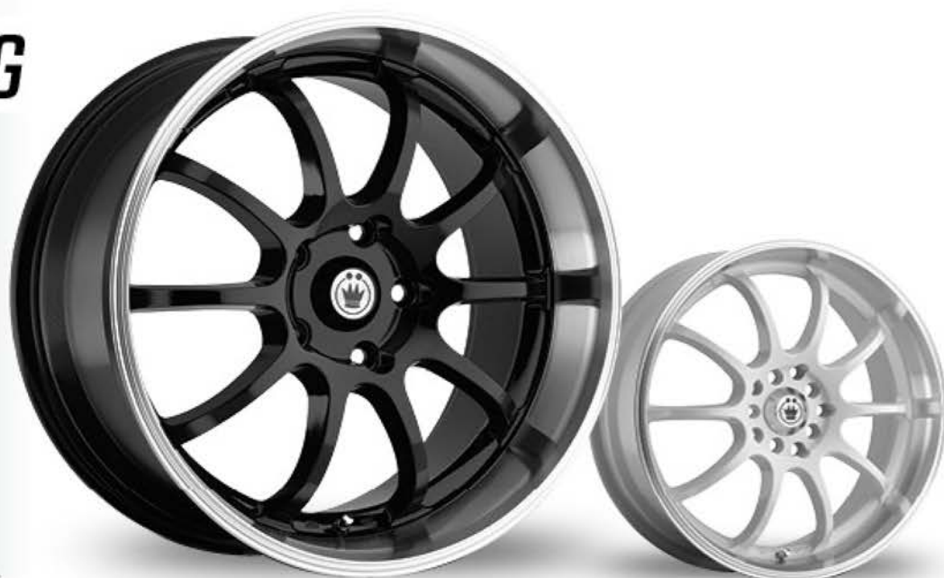
BLACK / MACHINED LIP