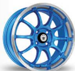
BLUE / MACHINED LIP

The LIGHTNING is a timeless wheel style, is available in a handful of cool colors and is combined with a sizable lip.