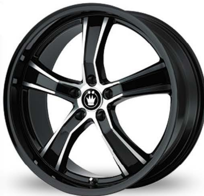
GLOSS BLACK / MACHINED FACE