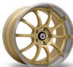
GOLD / MACHINED LIP