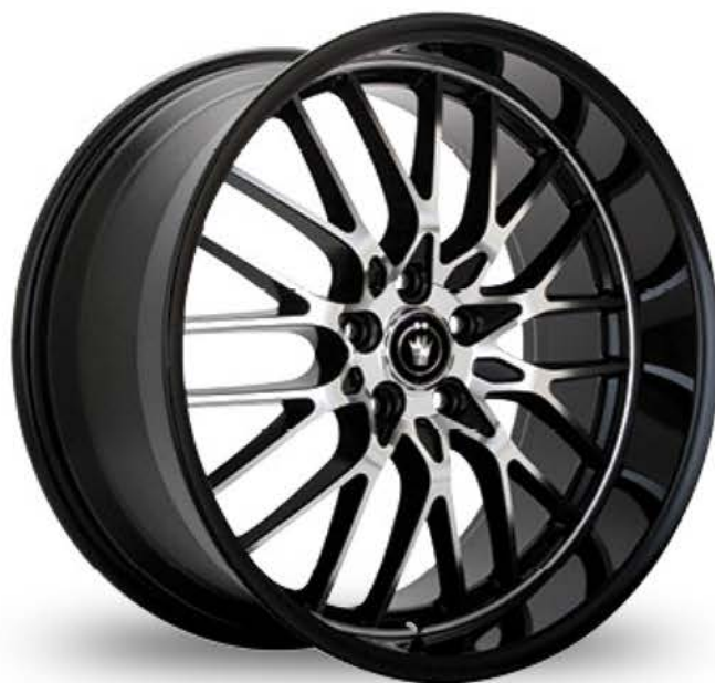
GLOSS BLACK / MACHINED FACE