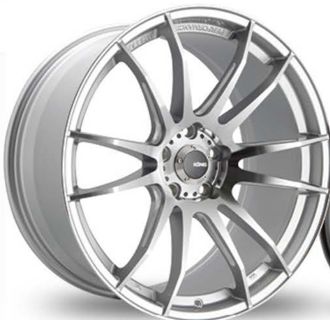
SILVER MACHINED FACE & BALL MILLED ACCENTS