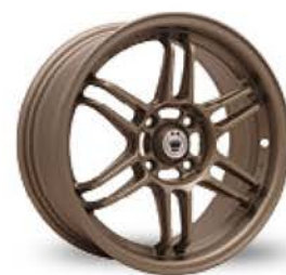
FULL MATTE BRONZE