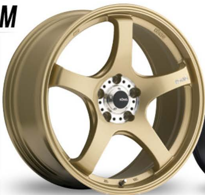
GOLD / MACHINED PCD