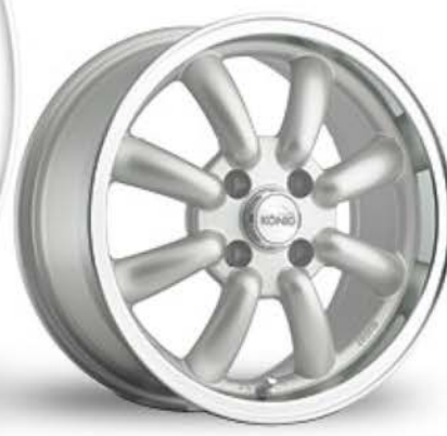
SILVER / MACHINED LIP