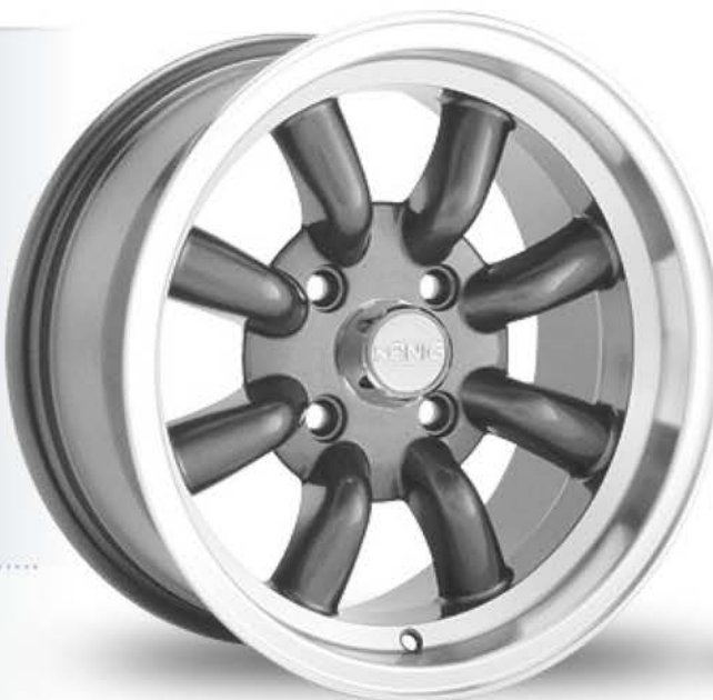
MATTE GRAPHITE / MACHINED LIP