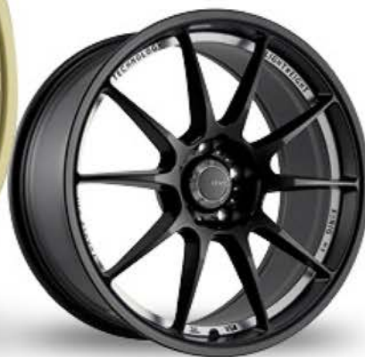
MATTE BLACK / MACHINED UNDERCUT