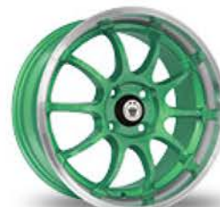
GREEN / MACHINED LIP