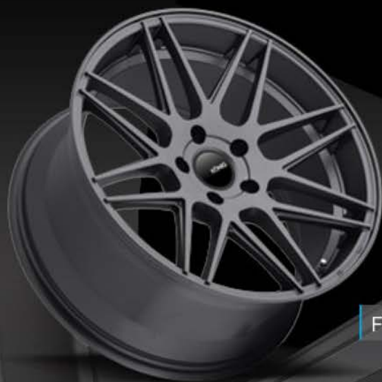
FINISHED FLOW FORMED WHEEL - KONIG INTEGRAM

THE FINAL PRODUCT IS LIGHTER, STRONGER, HAS INCREASED ELONGATION, AND GREATER SHOCK RESISTANCE