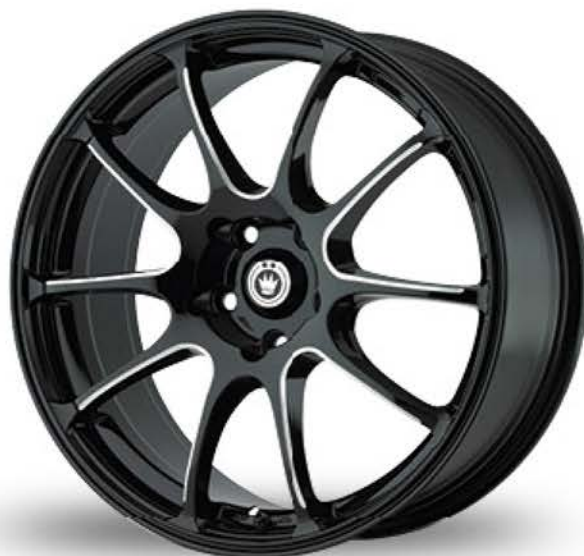
GLOSS BLACK / BALL CUT MACHINED SPOKES