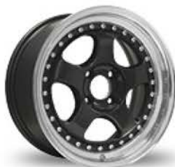
BLACK / MACHINED LIP

The CANDY offers a retro, 5-spoke design, with a 2-step machined lip and is available in four different colors, and low offsets.