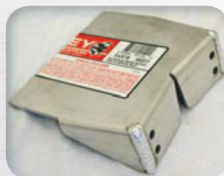
99201 – Rear