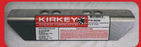
Seat Mount 99208