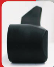
Right Side Head Pad