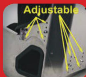
Can be adjusted over 2" vertically