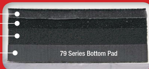
79 Series Bottom Pad

3/4" low rebound, high density, impact absorbing pad. Attached to seat bottom.