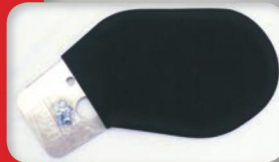
Optional leg restraints (02100 / 02200)