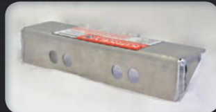
Optional rear mount available (99209) (Troyer 99207)