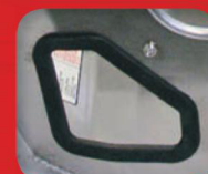
Molded Rubber Inserts