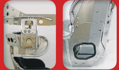
Head & Base Adjustability