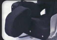
Optional leg separator available (99700)