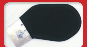
Leg Restraint #02100 RT/02200 LT