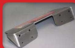
Rear Seat Mount #99205