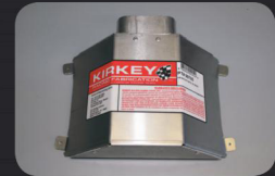
Optional air box available (99705)