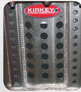
Rear Air Vents