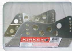
99203 – Bottom