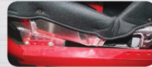
Bottom Mount – 92 Series