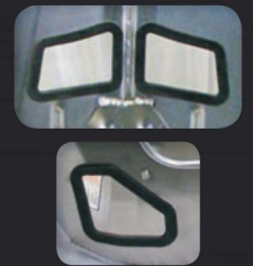
Molded Rubber Inserts