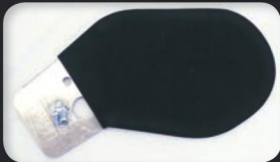
Optional leg restraints available (02100 / 02200)