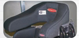
45.2 Head Surround