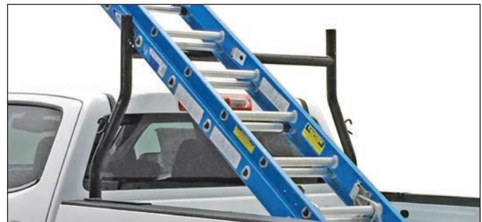
SHOWN WITH 1 - #30050