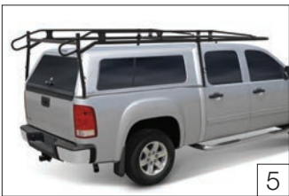
PRO III MEDIUM DUTY RACKS