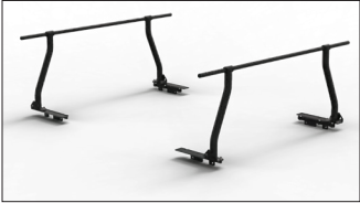
30070 BASE RACK