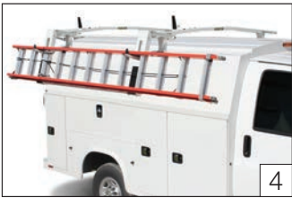
COVERED SERVICE BODY RACKS