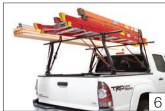
ADVENTURE SPORT TRUCK RACK