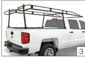
PRO III MEDIUM DUTY RACKS