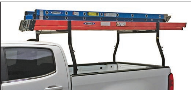
SHOWN WITH 2 - #30050