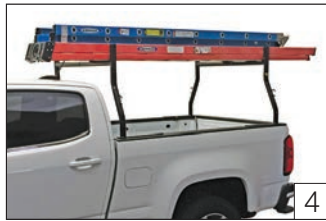
ECONO TRUCK RACKS