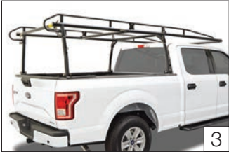
PRO II HEAVY DUTY RACKS