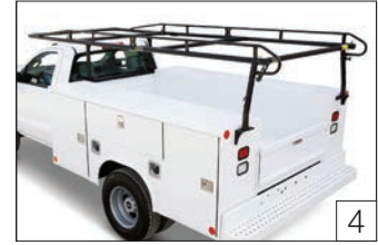
SERVICE BODY RACKS