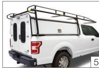
PRO II HEAVY DUTY RACKS