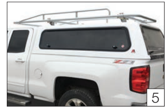
PRO III MEDIUM DUTY RACKS