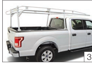
PRO IV MEDIUM DUTY HD ALUMINUM RACKS