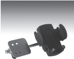
PIVOTING CELL PHONE HOLDER

Specifications subject to change without notice