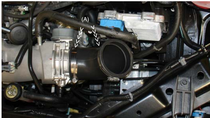
Prior to installing the elbow place a clamp over each end of the elbow (A). Take the 60 degree elbow and press the 2 7/8" over the throttle body. Position the 3" inlet side so that it faces upward.