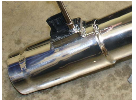
Close up of MR Technology at it's best. Once the mass air sensor is has been inserted into the adapter, use the 4mm button head screws to firmly secure the sensor in place.