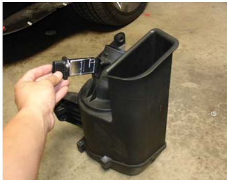
Remove the mass air sensor from the stock air box.