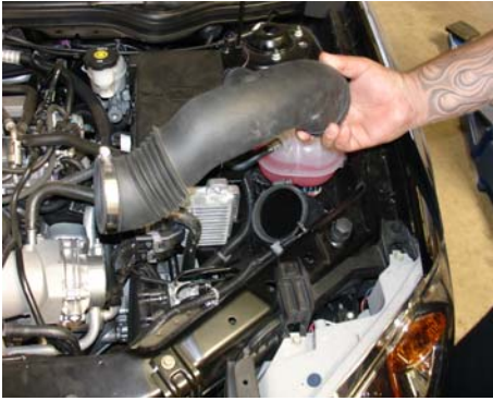
Remove the primary air intake dust connected to the throttle body and secondary air duct attached to the air box.