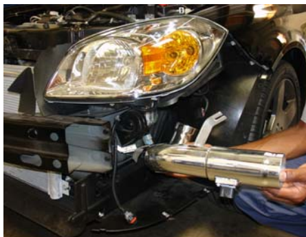
Carefully insert the 3" end of the intake into the corner bumper. Slip the 3" top end into the air duct opening that was lined with vinyl trim earlier.