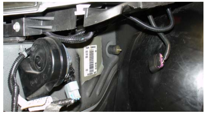
Take the vibra-mount and screw it into the pre-tapped 6mm hole. Screw the vibra-mount in until it completely bottoms out.