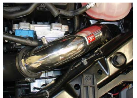
The 3" outlet on the end of the intake is now pressed into the silicone elbow as shown in this picture.