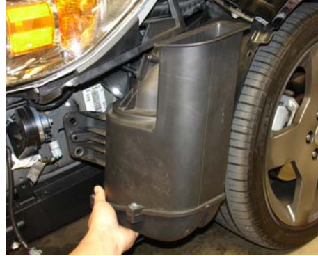
The stock air box is now unbolted from its stock location.