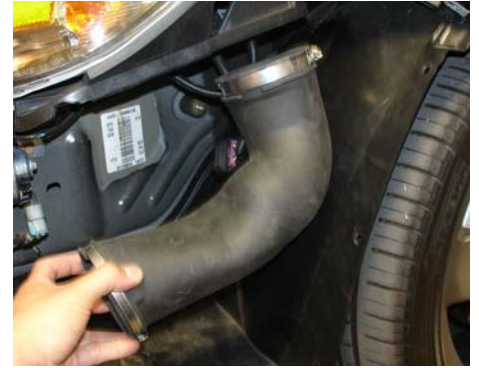
Remove the secondary air intake duct leading into the engine compartment. Use the included vinyl trim to line the air duct opening.