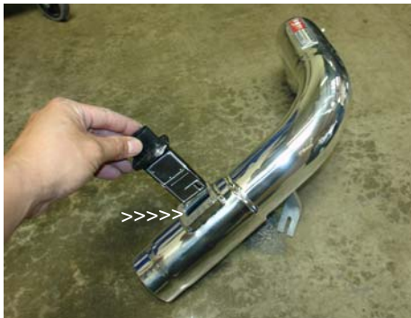
Carefully place the mass air sensor into the calibrated machined adapter.