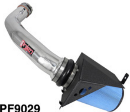
PF9029 21 HP/19 TQ