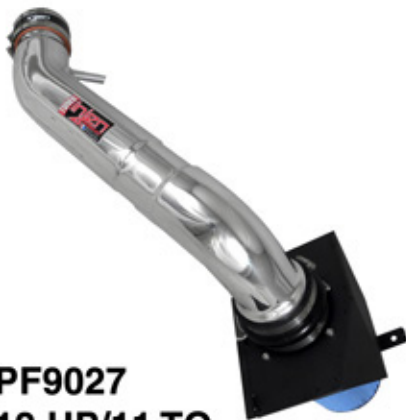
PF9027 12 HP/11 TQ