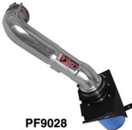
PF9028 12 HP/11 TQ