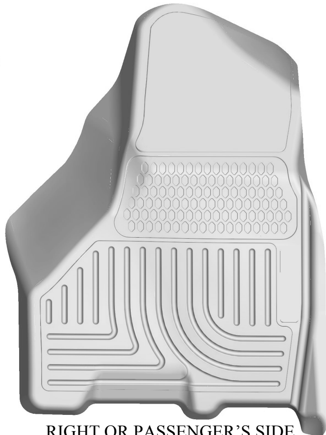
RIGHT OR PASSENGER'S SIDE

TO EASE INSTALLATION OF YOUR NEW FRONT LINERS, MOVE BOTH FRONT ROW SEATS TO THEIR MOST REARWARD POSITION. ONCE YOU HAVE INSTALLED YOUR LINERS, REPOSITION THE SEATS AS DESIRED.