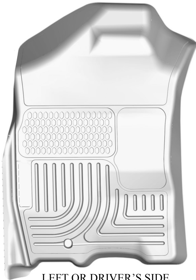
LEFT OR DRIVER'S SIDE