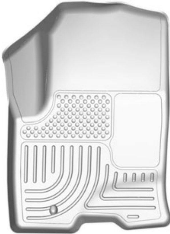
LEFT OR DRIVER'S