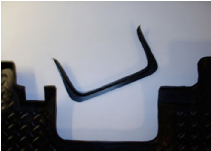
6317 SHOWN TRIMMED FOR USE WITH LONG CONSOLE (UP TO 04')