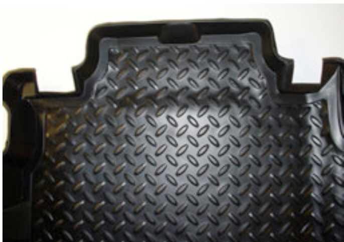
6317 SHOWN TRIMMED FOR USE WITH POWER SEAT EQUIPPED MODELS