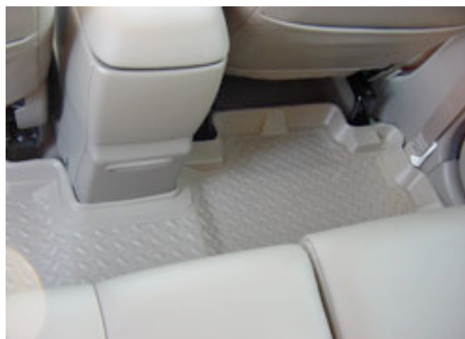
6317 SHOWN IN VEHICLE WITH THE LONG CONSOLE (UP TO 04')