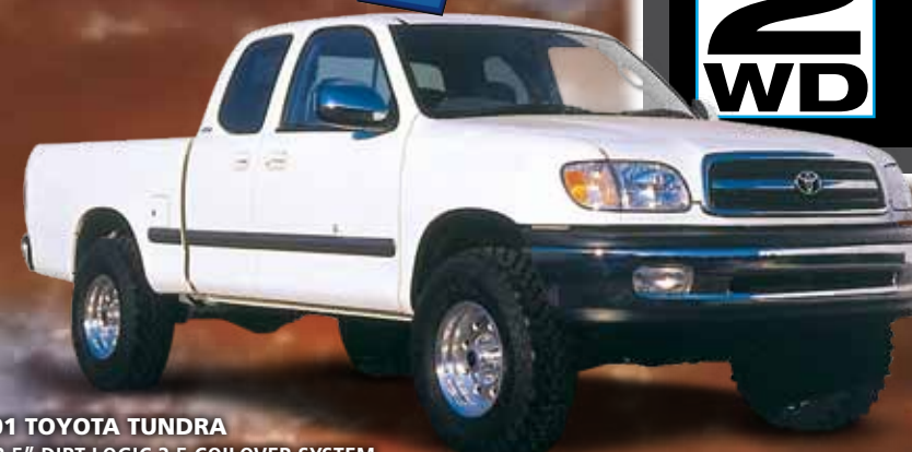
2001 TOYOTA TUNDRA • 0-2.5" DIRT LOGIC 2.5 COILOVER SYSTEM • 285/75R16 TIRES • 16X8 WHEELS W/ 4 5/8" BACK SPACING