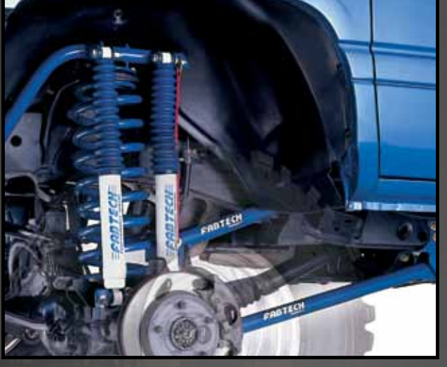
5.5" PERFORMANCE SYSTEM