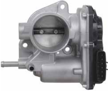
67-8022 - New Number! 2012-17 Toyota Prius C