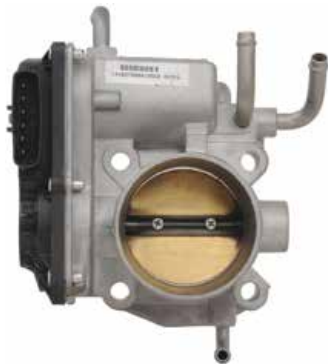
67-8000 - High Demand! 2004-07 Toyota Highlander, RAV4 & Camry; 2005-06 Scion tC