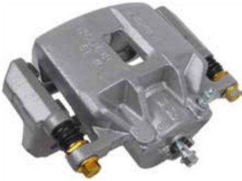
19-P2985 2000-16 Toyota Trucks

Premium look & rust protection, comprehensive availability!