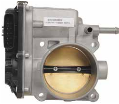
67-0014 - High Demand! 2007-17 Nissan Cube, Sentra, Versa & NV200