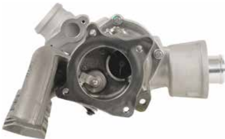
2N-408 2005-09 Audi A4, A4 Quattro