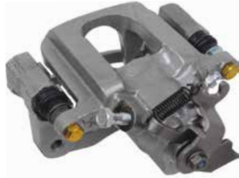
18-P5081 2009-12 Volkswagen, Dodge, Ram, Chrysler Trucks