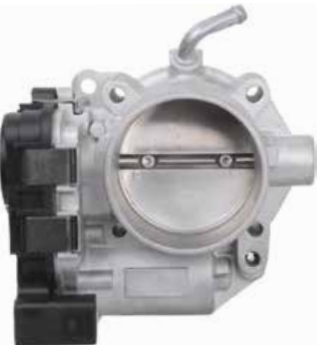
67-4007 - New Number! 2005-14 Volkswagen