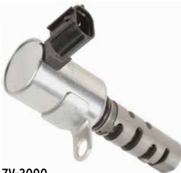
7V-3000 2008-17 Chrysler & Mitsubishi 2.0L & 2.4L