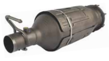
6D-20000 - High Demand! 2008-10 Ford F-350 & F-450