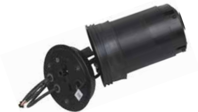
5D-1001L - Available Only at CARDONE! 2011 Chevrolet Silverado 2500HD/3500HD, GMC Sierra 2500HD/3500HD

A cost effective alternative to the O.E. dealer!