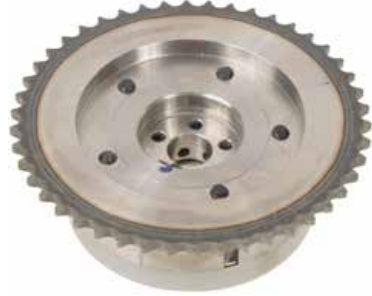
7V-1000P - High Demand! 2006-16 Chevrolet/GMC