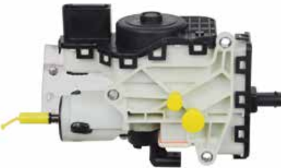
5D-9000 - Available Only at CARDONE! 2007-12 Dodge Ram 2500 & 3500