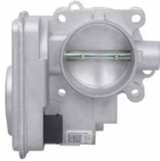
67-7002 - High Demand! 2008-13 Chrysler 200, Dodge 2.4L