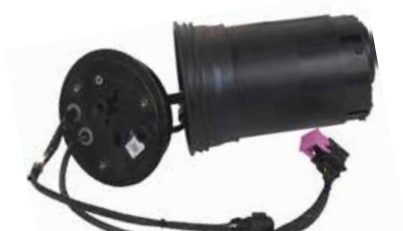
5D-1003L - Available Only at CARDONE! 2012-16 Chevrolet Silverado 2500HD/3500HD, GMC Sierra 2500HD/3500HD