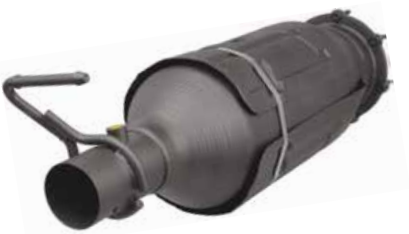
6D-20000A 2008-10 Ford Truck F450 F550