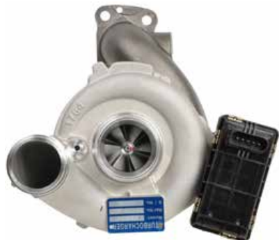
2N-322 2007-09 Dodge/Freightliner/Mercedes Trucks