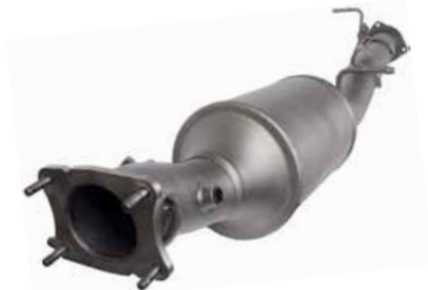
6D-18003 2007-09 GMC Silverado/Sierra

Media blasted and coated to increase corrosion protection Gaskets and temp sensors included for hassle-free installation