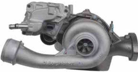
2T-220 2008-10 Ford Super Duty Pickups