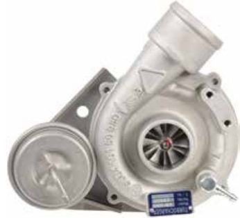
2N-510 2000-06 Audi A4, A4 Quattro/ Volkswagen Passat