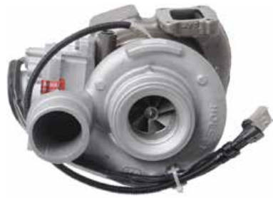
2T-314 - High Demand! 2007-09 Dodge Ram 2500-5500 6.7L