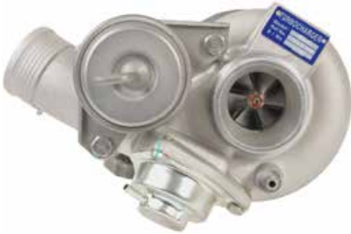
2N-720 2003-09 Volvo