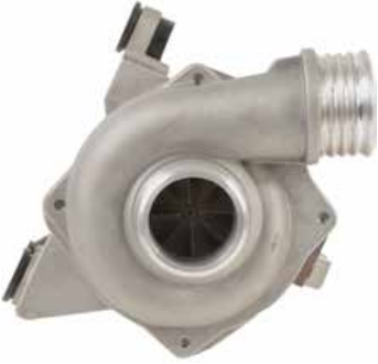
5W-9005 - High Demand! 2007-13 BMW

Featuring upgraded components over O.E. and including mounting brackets, vibration isolators and additional hardware for easy installation!