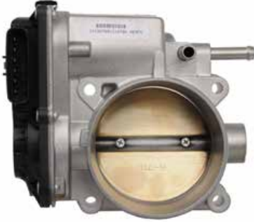
67-0012 - High Demand! 2004-17 Infiniti/Nissan Trucks

Best coverage, best price & exclusive application offerings!