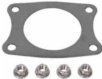
6D-18000K 2007-12 Chevrolet/GMC Trucks