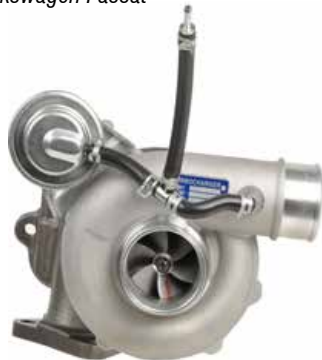
2N-841 2008-16 Subaru Impreza, WRX STI