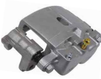
18-P4728 1999-2010 Chevrolet, GMC, Hummer Trucks