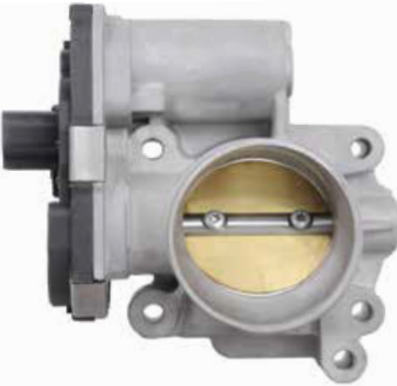
67-3007 - New Number & High Demand! 2007-10 Chevrolet Cobalt, HHR, Malibu/ Pontiac G5