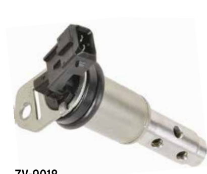
7V-9018 2006-16 BMW Family 3.0L