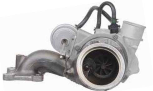
2T-235 2013-15 Ford/Lincoln