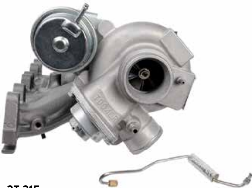
2T-315 2003-09 Chrysler PT Cruiser, 2003-05 Dodge Neon