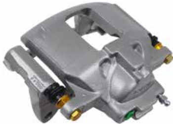
18-P5045 2007-12 Chrysler, Dodge, Jeep, Ram, Volkswagen Trucks