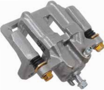
19-P2589 2003-11 Honda Element; 1999-2008 Acura CL, TL