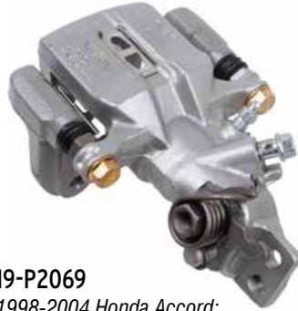
19-P2069 1998-2004 Honda Accord; 2004-08 Acura TSX