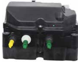
5D-3002 - High Demand! 2010-12 Dodge Ram 3500, 4500, 5500