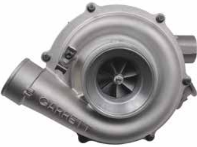
2T-206 - High Demand! 2005-07 Ford 6.0L Trucks