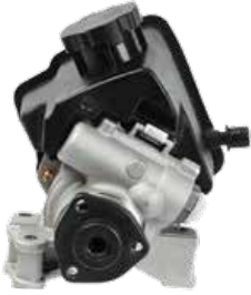
Power Steering Pumps

Lowest comeback rate in the aftermarket - at a fraction of the O.E. price!