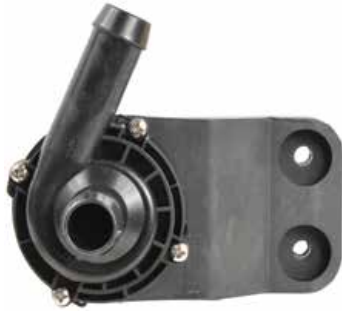
5W-1007 - High Demand! 2008-10 Ford Super Duty F250, F350, F450, F550