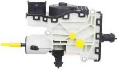
5D-2000 - High Demand! 2010-13 Mercedes Sprinter 2500 & 3500

Plug-and-play design makes installation a snap!