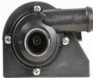
5W-4006 - High Demand! 2008-12 Audi A3, TT; Volkswagen EOS, GTI, Jetta, Passat, Tiguan