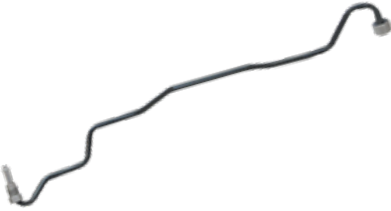
Hydraulic Transfer Tubing