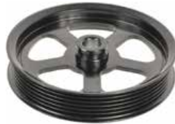
Power Steering Pulleys