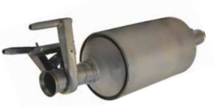
6D-16000 - Available Only at CARDONE! 2010-13 Mercedes Sprinter 2500 & 3500

Finally, a cost-effective alternative to the O.E. dealer!