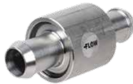
In-Line Power Steering Filters