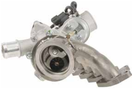
2N-115 - High Demand! 2011-16 Buick/Chevrolet Trucks, Chevrolet Cruze & Sonic