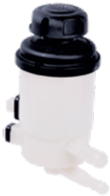
Remote Power Steering Reservoirs