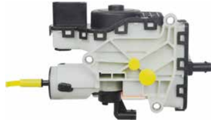
5D-9002 - Available Only at CARDONE! 2007-09 Chevrolet Silverado, GMC Sierra 2500HD & 3500 HD 6.6 ft. bed