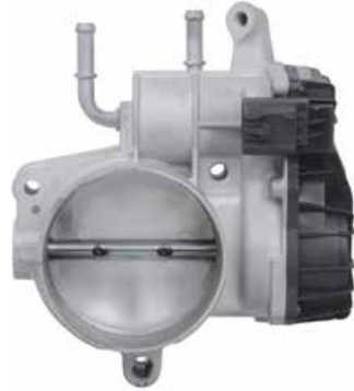
67-9008 - New Number! 2010-14 Hyundai/Kia Trucks