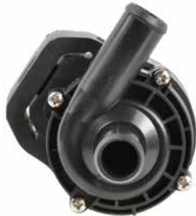
5W-3006 2003-12 Mercedes Benz