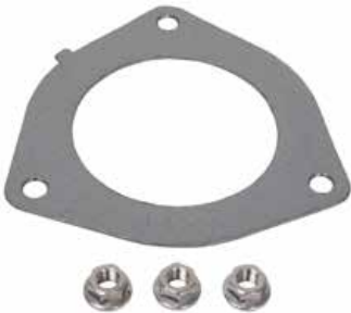
6D-17000K 2007-12 Dodge/Ram Trucks 2500, 3500