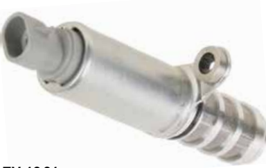
7V-1001 2008-15 GM Family 2.0L, 2.2L, & 2.4L

Guaranteed reliable performance at a fraction of the market price!