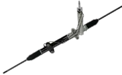
Rack & Pinions