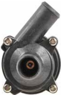
5W-3004 1998-2005 Mercedes ML Series