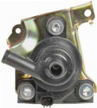
5W-2008 - High Demand! 2004-09 Toyota Prius