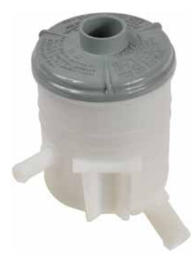
3R-216 - High Demand! 2001-05 Acura, Honda

Matched O.E. design, includes reservoir cap.