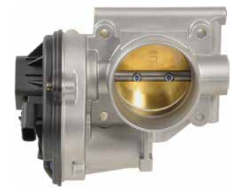
6E-6008 - High Demand! 2005-07 Ford/Mercury Vehicles