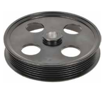
3P-35133 - High Demand! 2001-07 Chrysler, Dodge