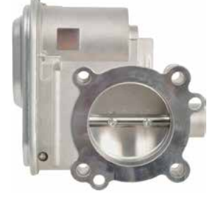
6E-7002 - High Demand! 2007-17 Jeep Trucks; Dodge/Chrysler 2.4 L Vehicles