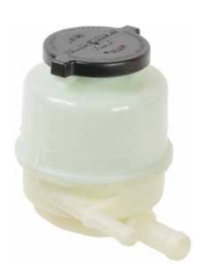
3R-102 - High Demand! 2002-12 Lexus, Toyota