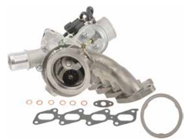
2N-115 - High Demand! 2011-16 GM vehicles