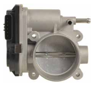
6E-0012 - High Demand! 2004-10 Infiniti Trucks; 2004-17 Nissan Trucks