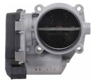
67-4012 - Available Only at CARDONE! 2010-16 Audi S5/S4 V6 3.0L

Best coverage, best prices, exclusive application offerings!