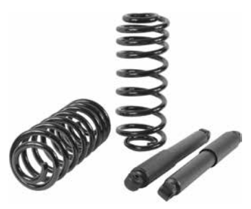
4J-1004K 2007-17 Ford/Lincoln Trucks - Rear