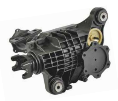
3A-18015IOJ – New Release! 2001-06 Cadillac/GMC/Chevrolet Trucks w/3.73 Axle Ratio (GT4) and w/10 Axle Cover Bolts and w/8.25" Ring Gear

3A-2009LOJ – Available Only at CARDONE! 2005-08 Ford E-250 Econoline w/o Limited Slip Differential and w/Dana Model 60 Axle and w/3.73 Axle Ratio and w/10 Axle Cover Bolts