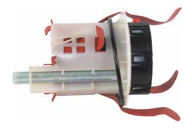
5D-3000 - High Demand! 2010-12 Dodge Ram 2500, 3500, 4500HD, 5500HD