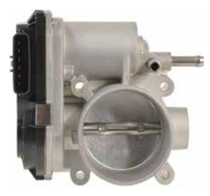
6E-0014 - High Demand! 2007-17 Nissan Vehicles