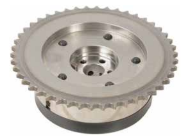
7V-1000P - High Demand! 2006-17 Buick/Chevrolet/GMC/Pontiac/Saturn