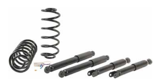
4J-0005K - High Demand! 2000-06 General Motors Trucks

Convert air suspension systems to a cost-effective coil spring solution.