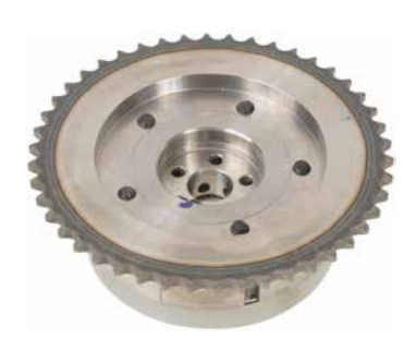
7V-1005P - High Demand! 2006-16 Buick/Chevrolet/GMC/Pontiac/Saturn