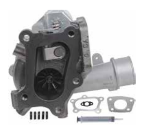
2T-750 - High Demand! 2007-11 Mazda CX-7, 2.3L