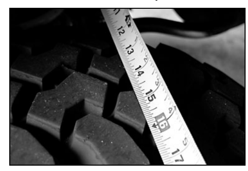
HINT : For example, measure from the edge of a tire tread lug to the outboard side of chassis, then repeat the measurement on other side of vehicle using exact same points.

O If the two measurements are equal, the axle is centered. If measurements vary, divide the difference in half to determine the amount of adjustment required. HINT: If axle housing is not centered, the chassis can be laterally shifted using either of the following methods.