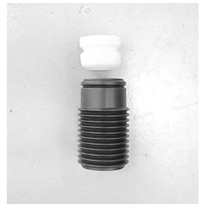
OE front bumpstop / Eibach boot