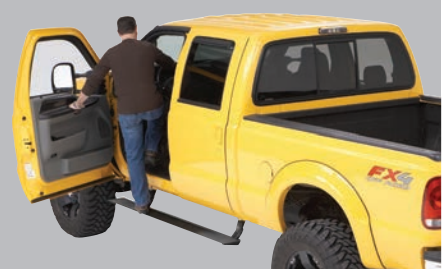
Ford® F250 application Chevy<sup>®</sup> Silverado (gasoline) application

Powerboard on 2012 Ford F150 Crew Cab 75141-15