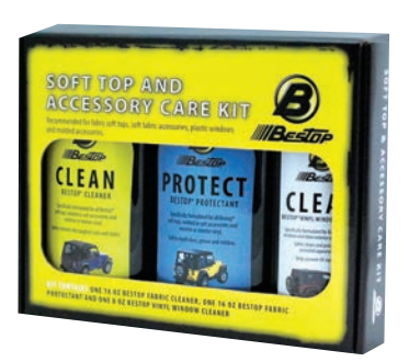
Bestop Fabric Care now available in a handy 3-pack #11205-00 & #11215-00 (boxed)