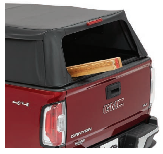
Tailgate opens with window installed