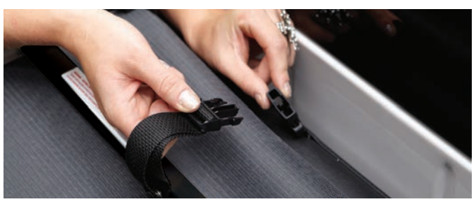
Folded and secured in back of cab, the EZ Fold {}^{\rm TM} allows for nearly full bed use