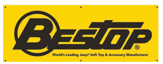
6' x 2' Bestop Banner (PART NUMBER: BAN10)