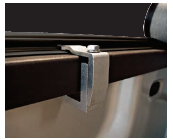
No-drill installation clamps secure frame rail assembly to bed