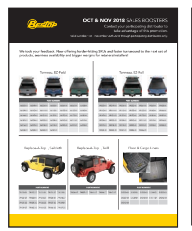
Access to Bestop marketing materials such as quarterly sales boosters