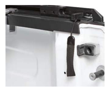
Pull tabs at both rear corners for convenient operation