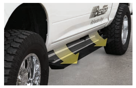
Dodge® application and movement of Powerboard