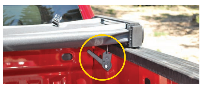
Heavy-duty adjustable clamps secure tonneau to truck bed