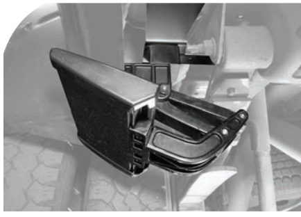
Side mount retracted on 2010 Dodge® Ram dually