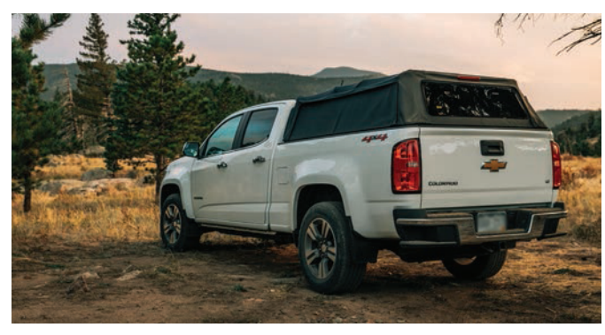
Access to Bestop marketing materials such as high-resolution photography