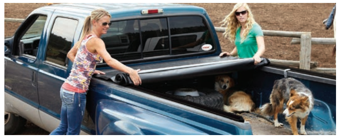
Roll-style tonneau, attaches with hook-and-loop fastener, mounts on top of bed rails