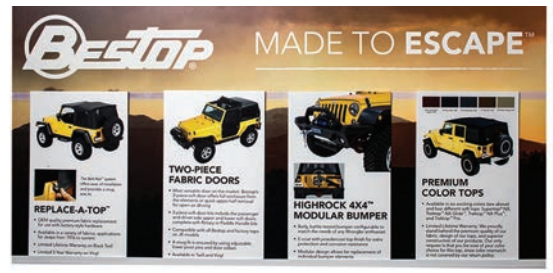
2' x 4' Sample Wall Mount Display (PART NUMBER: 575.85)

In 2019 Bestop® offers its most thorough and personalized support to our Jobber Network. Join today to receive the benefits that over 1,000 Jobbers are using to be successful with Bestop Jeep and Truck accessories.