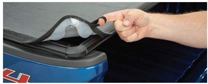
ZipRail<sup>™</sup> attaches to truck bed by tucking fabric into the Belt-Rail<sup>™</sup> attachment system. Pull tabs at both rear corners for convenient operation