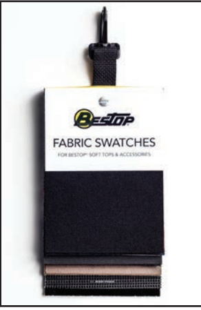
Fabric Swatch Book (PART NUMBER: 39318-00)