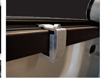
Fully-integrated bow system for a No-drill installation clamps secure

smoother profile and easier install frame rail assembly to bed