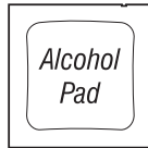
Alcohol Pad x2