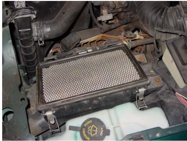
4. Remove air cleaner cover. ↑