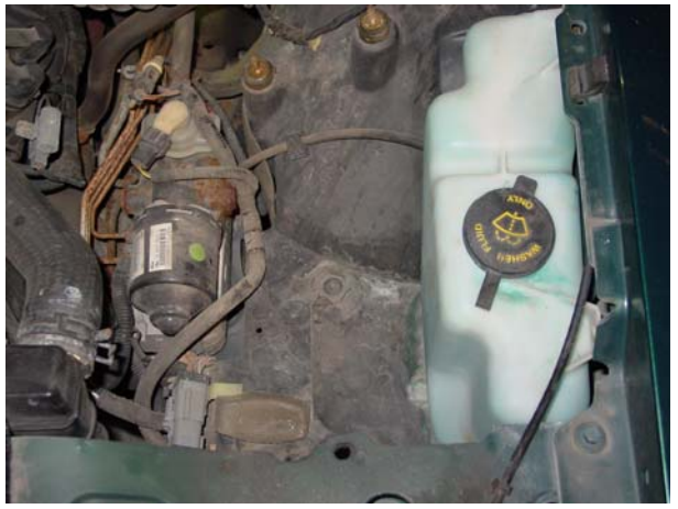
7. Air cleaner removed from vehicle. ↑