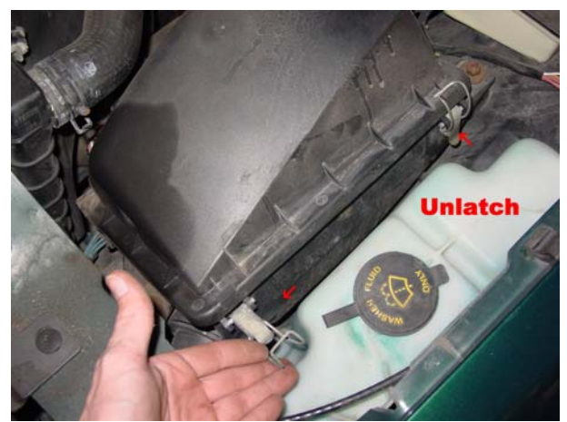
3. Unlatch air cleaner cover.