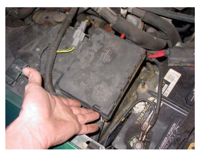
16. Open fuse box.