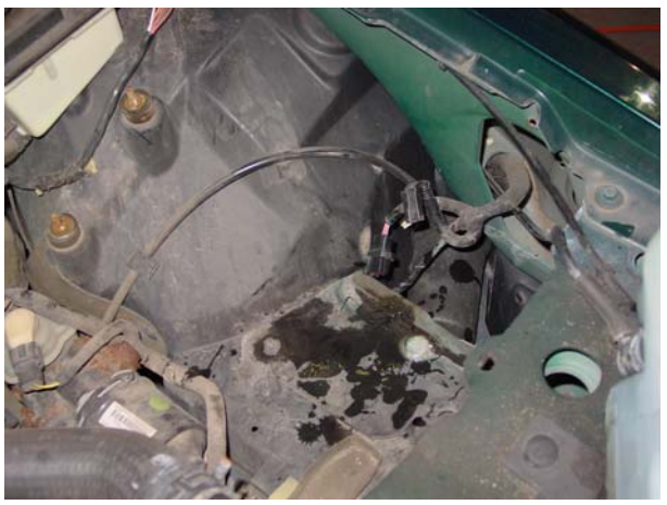
9. Washer reservoir removed from vehicle. ↑