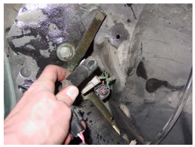
11. Remove power plug from air compressor. ↑