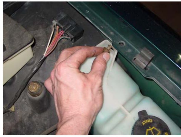
8. Remove windshield washer reservoir. 1