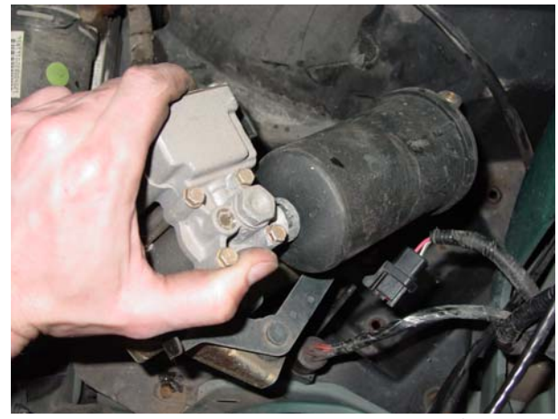
14. Carefully remove air compressor. ↑