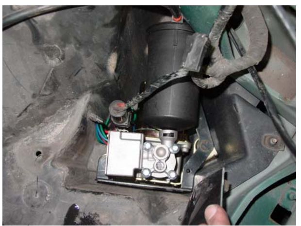
15. Install new compressor on vehicle. ↑ (Revere steps 3-14)