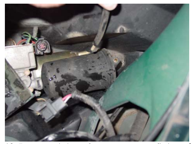
12. Remove air hose from compressor fitting. ↑