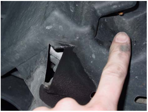
13. Unbolt compressor from under vehicle. ↑