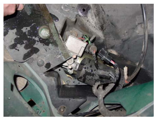
10. Unsnap compressor cover. ↑