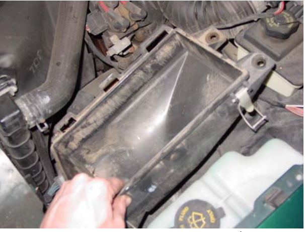
6. Remove bottom air cleaner case. ↑