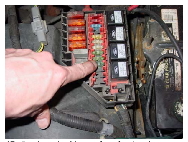
17. Replace the 30 amp fuse for the air suspension motor.