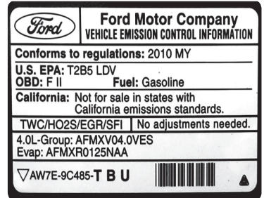
Typical label showing a Federal system

Federally certified vehicles' stickers will reference "Federal / EPA."