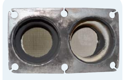
Coolant from a head gasket leak on one cylinder has steam blasted carbon from the Right Inlet. Note the coolant contamination to the substrate.