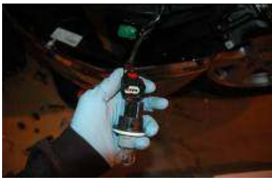
Unclip the parking bulb from wire harness.