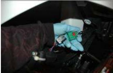
Re-clip the headlight wire harness into the new headlight.