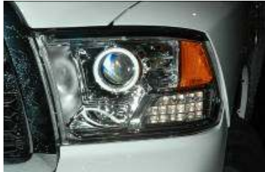
Test all functions before driving.