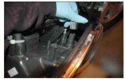
Re-clip the parking light socket into the new headlight.