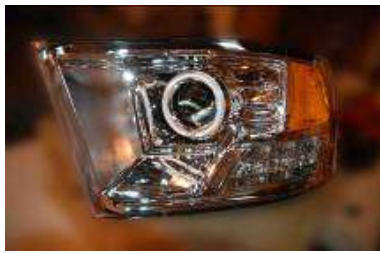
Take out the new projector halo led headlight from the box.